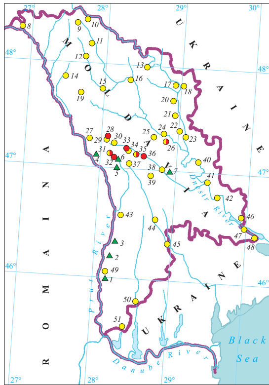
Fig. 1. Distribution of Bombina bombina in Moldavia: 1, Kagul; 2, Gotești, 3, Cantemir; 4, Ungeni; 5, Nisporeni; 6, Vulcănești; 7, Kishinev; 8, Lipkani; 9, Lipnik; 10, Ataki; 11, Fitnica; 12, Cetrosi; 13, Soroki; 14, Sturzeni; 15, Bel'tsy [= Bălți]; 16, Leninskii; 17, Curaturi; 18, Erzovo; 19, Novo Limbeni; 20, Rezina; 21, Pohribeni; 22, Susleni; 23, Malovata; 24, Orgeyev; 25, Moroseni; 26, Ivanča; 27, Todirești; 28, Cornești; 29, Redeni Forest Reserve; 30, Volčinec; 31, Čutești; 32, Seliști; 33, Tuzora; 34, Vorniceni; 35, Bykovec; 36, Capriani; 37, Kodry Reserve; 38, Kharitonovka near Kishinev; 39, Vasieni; 40, Delaceu; 41, Gura-Bikului; 42, Cickani; 43, Tomai; 44, Zloti; 45, Abaklia; 46, Nezavertailovka; 47, Olanești, Purkari; 48, Palanka; 49, Roșu; 50, Cairaklia; 51, Etulia. References: Didusenko (1959): 41, 48; Stugren and Popovici (1961): 24; Tofan (1965): 26; Tofan (1966a): 8–18, 22–28, 30, 31, 33–36, 39–47, 49–51; Tofan (1966b): 26, 31, 32; Stugren (1980): 19–21, 38, 47; Kozar (1987): 29, 37; our samples (▲): 1–7; B. bombina (●): 8–25, 27, 29, 30, 34, 37–51; Tofan's " B. variegata " (●): 26, 28, 31–33, 35, 36.

museum studies. The data on occurrence of the Danube newt, Triturus dobrogicus , have been already published (Litvinchuk and Borkin, 1995).