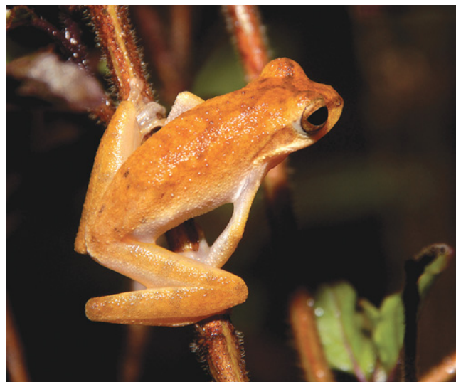
Fig. 10. Chiromantis nongkhoriensis from Pramaoy.

All specimens were calling while seated on small leaves of low bushes adjacent to temporary rain pools along the edge of the main trail. Stuart & Emmet (2006) report Chiromantis nongkhorensis from the central and southeastern Cardamoms