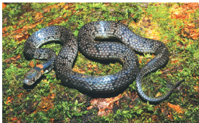
Fig. 20. Pareas margaritophorus from Camp 1.

Despite the growing number of published reports resulting from expeditions into the Cardamom Mountains (Daltry & Chenang, 2000; Daltry & Traeholt, 2003; Grismer et al., in press; Long et al., 2001; Ohler et al., 2002; Stuart & Emmett, 2006; Stuart & Platt, 2004; and Swan & Daltry, 2002) new additions to their herpetofauna and to that of Cambodia still continue to mount at a surprising rate. The 19 new records reported here for species in the northwestern Cardamoms (Table 1) represent six new records for Cambodia ( Chiromantis samkosensis , Cnemaspis chanthaburiensis ,