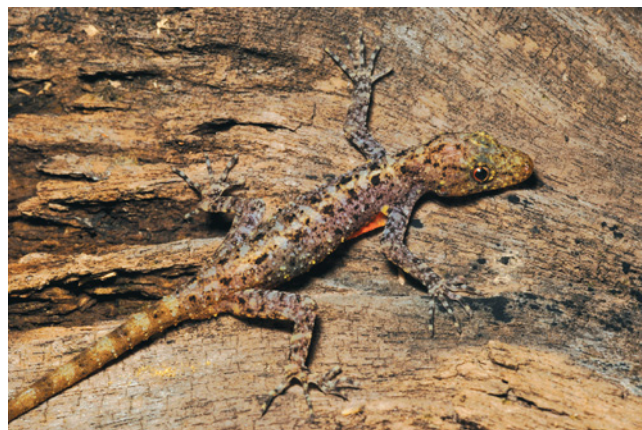
Fig. 12. Cnemaspis chanthaburiensis from Camp 1.