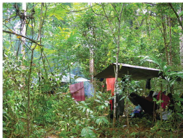
Fig. 5. Camp 2 in a secondary forest 10 km east of the eastern foothills of Phnom Samkos, Pursat Province, Cambodia.