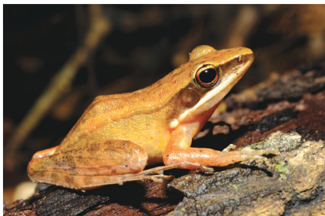
Fig. 8. Rana cf. miletti from Camp 1.

Remarks. – Delorme et al. (2005), Frost et al. (2006), and Wilkinson et al. (2002) convincingly demonstrated that Chirixalus Boulenger, 1893, is paraphyletic with respect to other rhacophorid genera. To avoid this paraphyly, Frost et al. (2006) placed C. palpebralis into their newly formed genus Feihyla , and Delorme et al. (2005) placed C. gracilipes into their new genus Aquixalus . Chirixalus romeri , C. ocellatus , and C. vittatus were left incerta sedis by Frost et al. (2006)