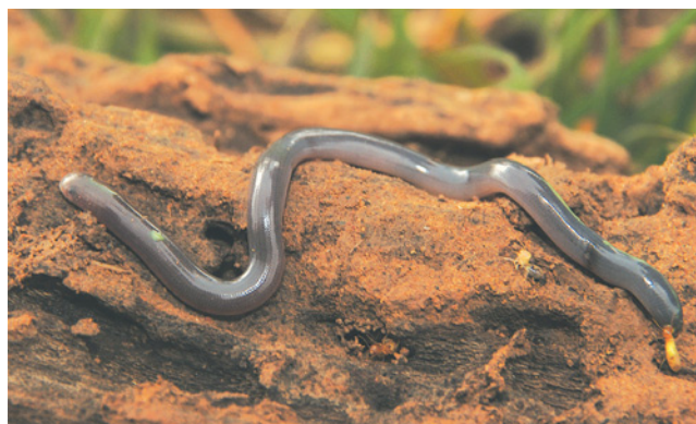
Fig. 16. Typhlops diardii from Che Teal Chrum.

Remarks. – An adult female (SVL 944 mm) agrees with the description of this species by Taylor (1965) and that of a specimen from the central Cardamoms (Stuart & Emmett, 2006) in having eight supralabials; 12 infralabials; one preocular; two postoculars; 21 body scale rows with enlarged vertebrals; 252 ventral scales; 138 divided, subcaudal scales; and being uniform green above with black interstitial skin.