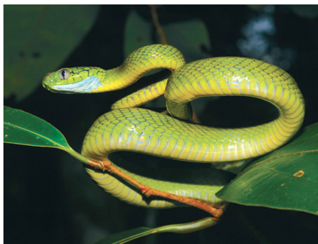
Fig. 17. Boiga cyanea from Camp 1.

All specimens were collected at night in temporary rain pools and buffalo wallows within the village. Daltry & Chenang (2000), Long et al. (2001), and Daltry & Traeholt (2003) reported this species from the central Cardamoms.