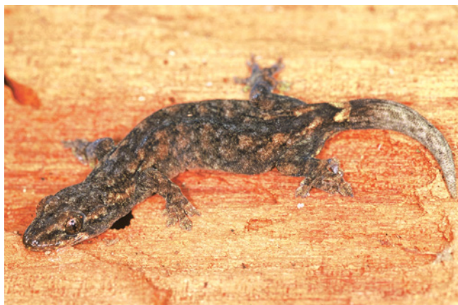
Fig. 13. Hemiphyllodactylus cf. yunnanensis from Phnom Tumpor.

Material examined. – LSUHC 8242: Phnom Tumpor, Ou Kran stream (102°88.805'E 13°69.474'N, 1,100 m) 8 May 2006.