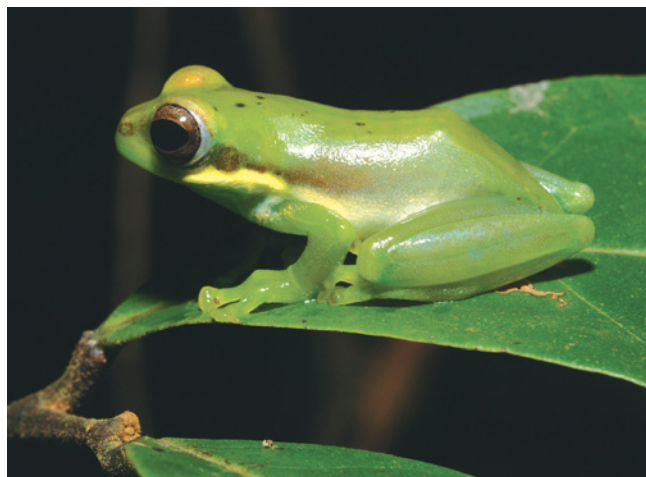
Fig. 11. Chiromantis samkosensis from Camp 1.

Material examined. – LSUHC 7882: Camp 1, 8 Aug.2006.