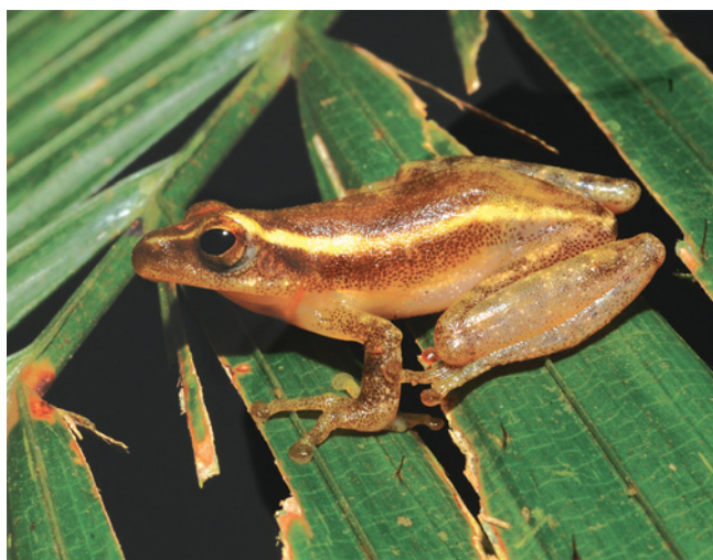
Fig. 9. Chiromantis vittatus from Camp 1.