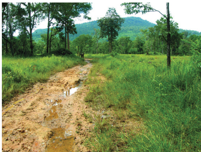
Fig. 3. Disturbed habitat surrounding Che Teal Chrum Village, Pursat Province, Cambodia.