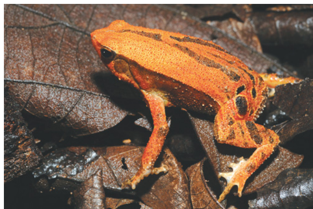
Fig. 7. Kalophrynus interlineatus from Che Teal Chrum.

Remarks. – A series of eight males (SVL 45–48 mm) match the description of this species by Smith (1921) and more closely the expanded descriptions by Inger et al. (1999) and Chuaynkern et al. (2004) in having small round vocal sacs below the angle of the jaws with openings in the corners of the mouth; a strong dorsolateral fold; granular skin on back with many small tubercles capped by spinules with larger tubercles on the side; smooth skin on the belly; and a wide, dark stripe extending from the tip of the snout, through the eye, to the tympanum. The specimens differ in having more extensive webbing on the hind foot that extends to over one-half the length of the toes and the SVLs of males are greater