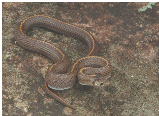
Fig. 19. Oligodon sp. from Che Teal Chrum.

Material examined. – A juvenile female (SVL 285 mm) matches Grossmann & Tillack’s (2003) characterization of