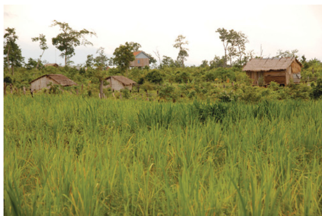
Fig. 2. Disturbed habitat in the town of Pramaoy, Pursat Province, Cambodia.