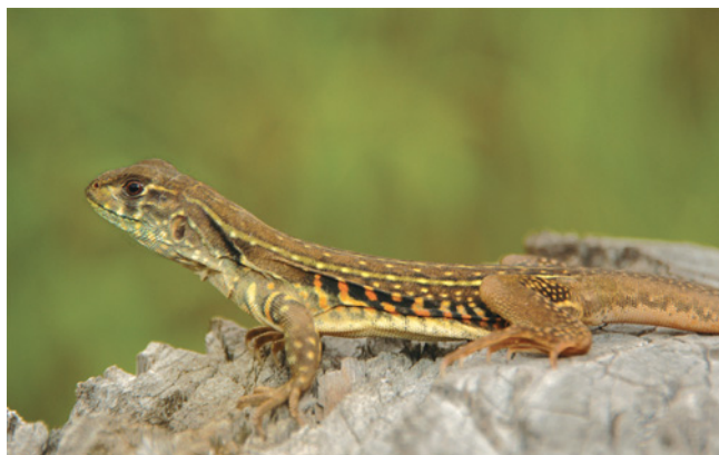
Fig. 15. Leiolepis belliana from Che Teal Chrum.

The specimens from Che Teal Chrum were collected by residents of the village, who use this species as a food source. Lizards were dug out of holes in open, grassy areas surrounding the village.