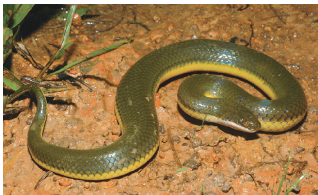
Fig. 18. Enhydris plumbea from Che Teal Chrum.