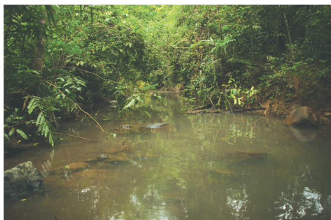
Fig. 6. Camp 3 in a transitional zone between dry dipterocarp forest and hill evergreen forest at the base of Phnom Samkos, Pursat Province, Cambodia.

Material examined. – LSUHC 7819: Che Teal Chrum, 5 Aug.2006.