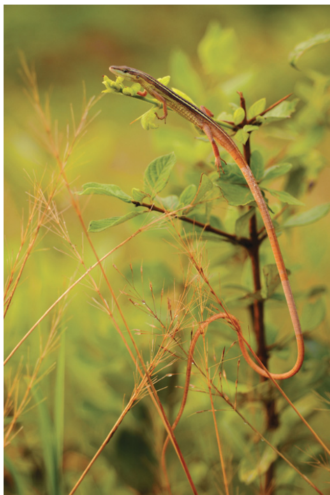
Fig. 14. Takydromus sexlineatus from Che Teal Chrum.

Material examined. – LSUHC 7796, 7810: Che Teal Chrum, 5 Aug.2006. LSUHC 7859, 8 Aug.2006. LSUHC 7998, 13 Aug.2006.