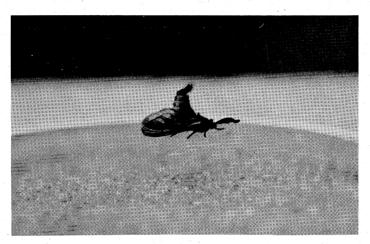
Fig. 1. Adult male Pryeria sinica exhibiting the "abdomen-elevation" behavior.

The experiment was conducted as previously described (Johki and Hidaka, 1979) but mealworms were chosen as the palatable control insects this time. One experimental