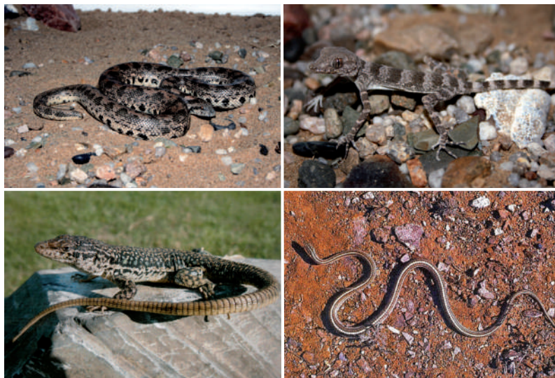
Fig. 4: Govi naked-toad gecko ( Cyrtopodion elongates ) (above right), Tatory sand boa ( Eryx tataricus ) in the valley Nogoos-tsav (above right), Slender racer ( Coluber spinalis ) in Uuliin Hudag, Middle Govi province, Multiocellated racerunner ( Eremias multiocellata tsaganbogdensis ); photos: Kh. MUNKHBAYAR.

Four species of amphibians and five species of reptiles are included into the Mongolian Red Book (1988, 1997). Also, the Mongolian Red List for amphibians and reptiles and the Summary Conservation Action Plans for Mongolian reptiles and amphibians (2006) are published by the Zoological Society of London. 66 % of Mongolian amphibians are evaluated as vulnerable by regional evaluation according to IUCN categories.