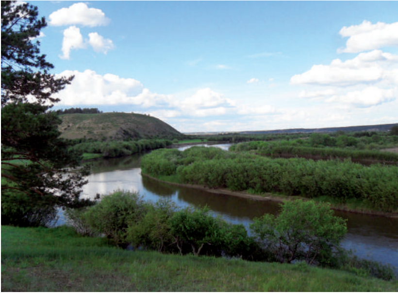
Fig. 5: Buureg Tolgoi, downstream of the river Orkhon, near Shaamar soum.