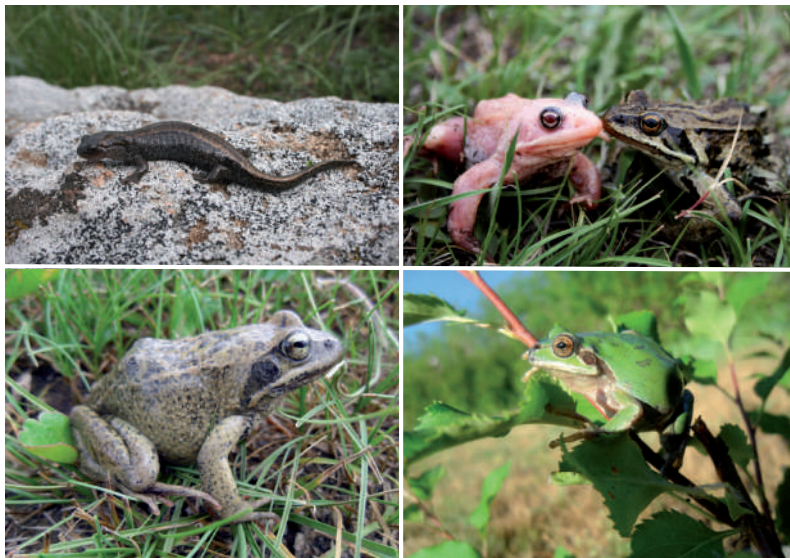
Fig. 3: Siberian salamander ( Salamandrella keyserlingii ) in the Darchad basin (above left), albino and normal Siberian frog* ( Rana amurensis ) (above right), Asiatic grass frog ( Rana chensinensis ) at Khargiltain-gol, Suchbaatar province (below left), and Japanese tree frog ( Hyla japonica ) (below right), which is registered in the Mongolian "Red Book" (1987).

We have found some species rare for last 30-50 years in the Mongolian desert and some new species records for Mongolia such as the Caspian even-fingered gecko ( Alsophylax pipiens ), Przewalski's wonder gecko ( Teratoscincus przewalskii ), Gobi naked-toed gecko ( Cyrtopodion elongates ), and Variegated racerunner ( Eremias vermiculata ). These findings are related to the improvement and intensity of research, and also regarding with global warming and expansion of thermophile organisms' distribution and area to the North.