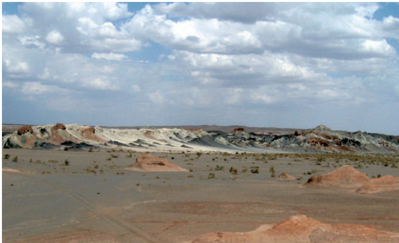
Fig. 6: General view of the valley of Nogoontsav, Trans-Altai Gobi