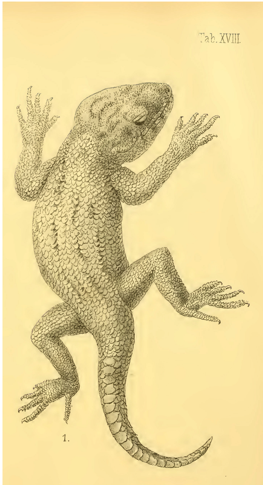
FIGURE 3. Teratoscincus zarudnyi Nikolsky 1896. Drawing from description of Nikolsky (1896, tab. XVIII).