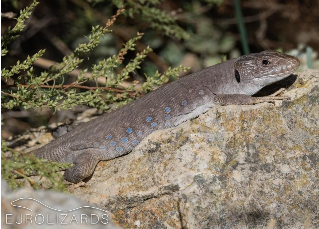
Female: E / Sierra Espuña, 18.09.2018 - Adults frequently show blue ocelli on the flanks.