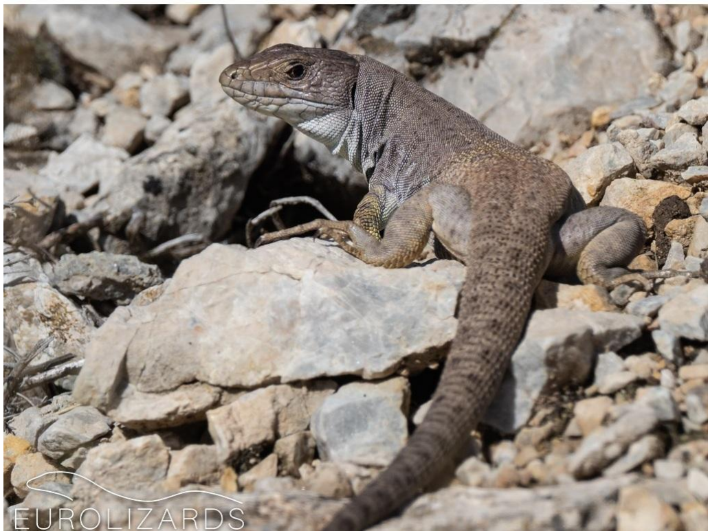
Male: E / Sierra Espuña (Murcia), 18.09.2018 - Note the absence of black reticulation on back and flanks.

Formerly, Timon nevadensis had been regarded as subspecies of Timon lepidus but it has been put into species rank in 2013. Its distribution range is limited to the Sierra Nevada and the Spanish east coast, reaching the Alicante Province in the north.