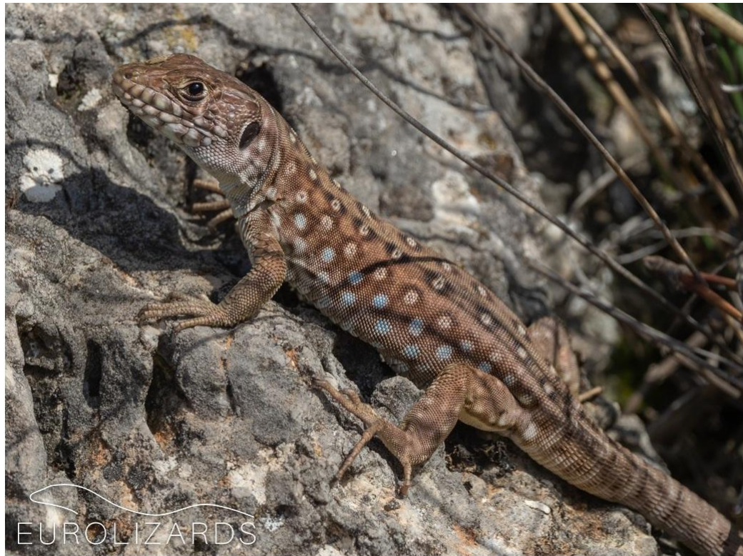
Juvenile: E / Sierra Espuña, 18.09.2018 - Note the dark edges of the labials.