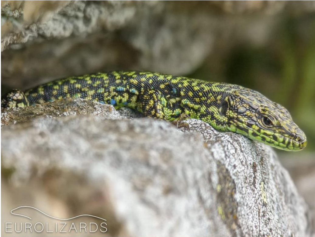
Male: E / Laguna de los Peces (Zamora), 03.09.2011 - Note the green basic colouration.