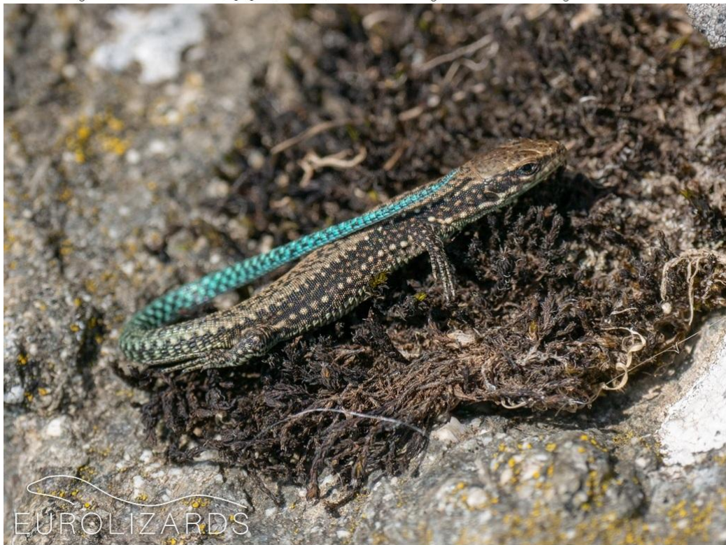
Juvenile: 19.09.2017, E / Laguna de los Peces (Zamora) - Note the blue tail.