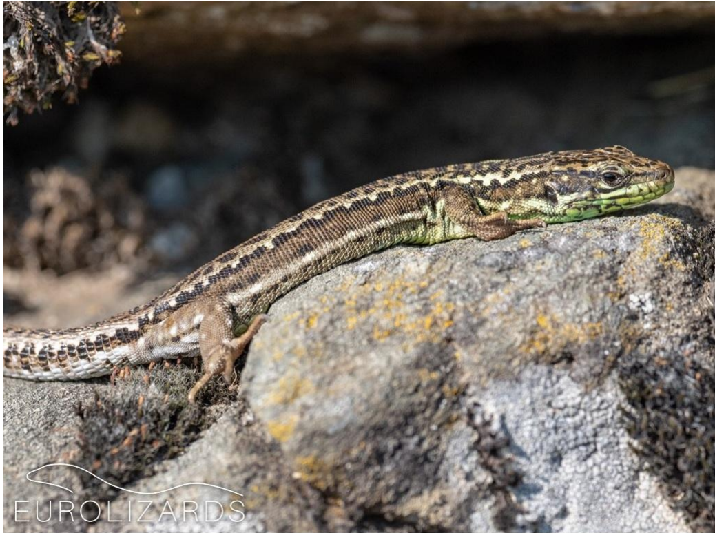
Female: E / Laguna de los Peces (Zamora), 19.09.2017 - If at all, females show a irregular and discontinuous light dorsolateral line.