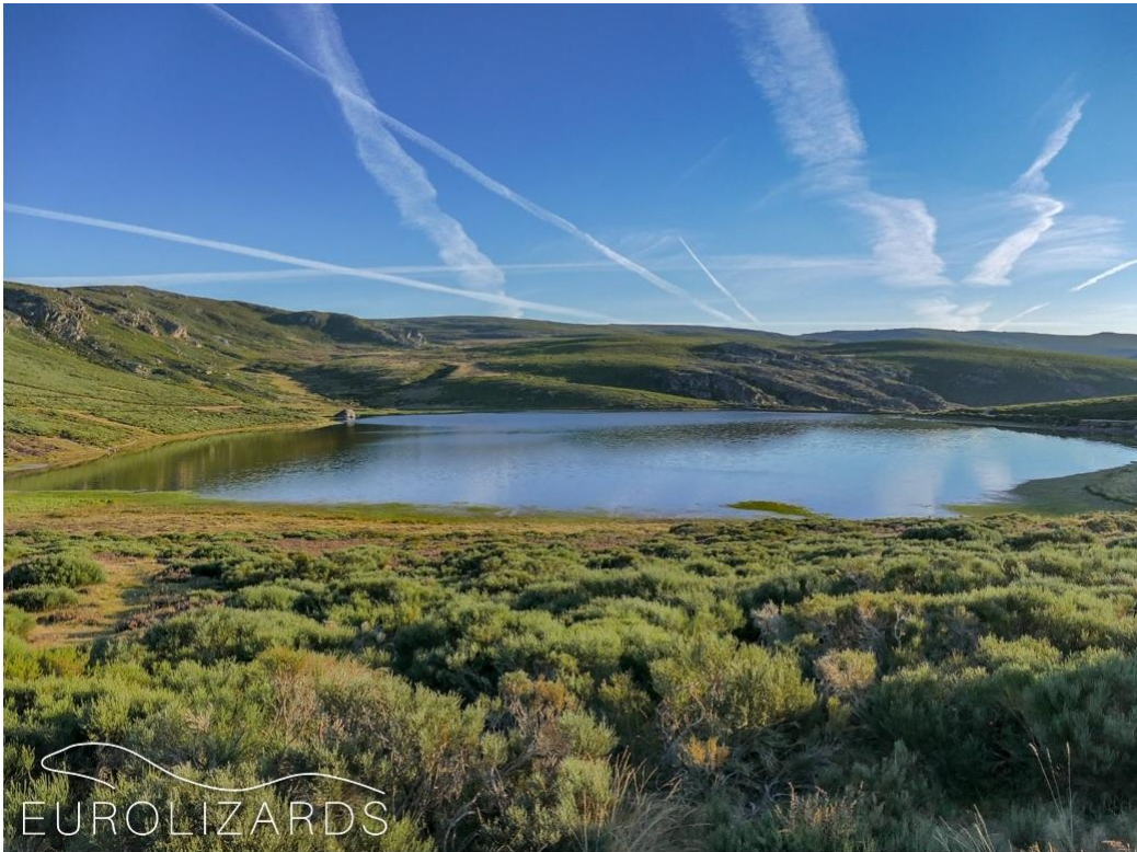
An almost Scottish highland scenery: Laguna de los Peces (Zamora) - habitat of Iberolacerta galani .