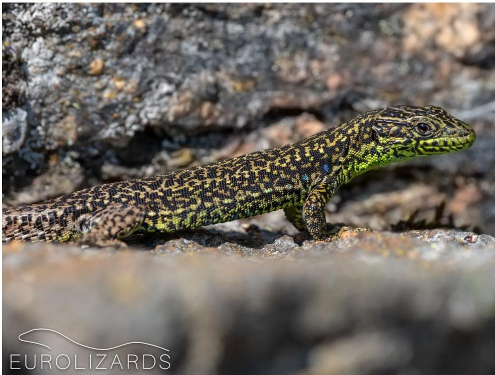
Male: E / Laguna de los Peces (Zamora), 19.09.2017 - Iberolacerta monticola is a cryptic but beautiful species.

Evolution is a nerd, obviously; for human eyes, Iberolacerta galani may look exactly the same as Iberolacerta monticola ; morphological differences between both species have only been unveiled by the art of statistics. However, without doubt, Galan's Rock Lizard is a beautiful Lacertid with green basic colour, heavy black reticulation and several blue ocelli: (statistically), it even seems to show more ocelli than any other Iberian Rock Lizard.