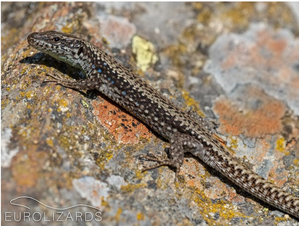
Male: 19.09.2017, E / Laguna de los Peces (Zamora): This subadult specimen shows already at least five blue ocelli.