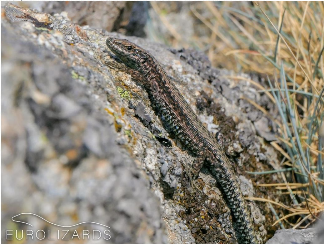
Subsp. cyreni, male: E / Puerto De La Morcuera (Sierra de Guadarrama), 01.10.2010 - Note the absence of blue ocelli.