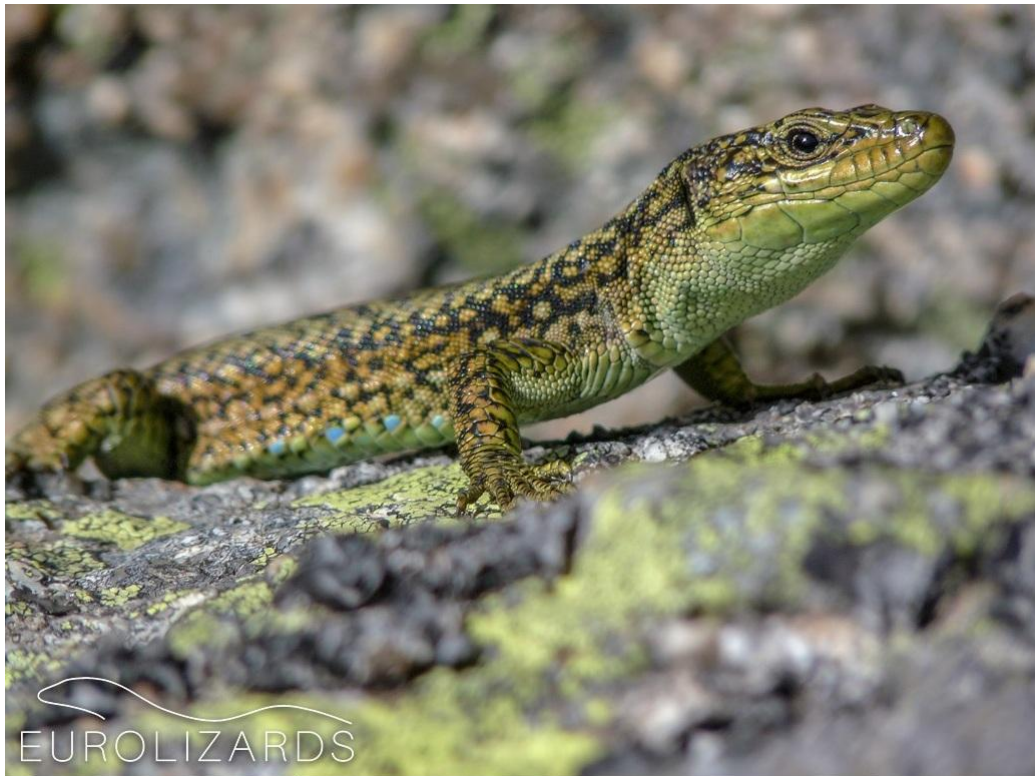
Subsp. castiliana: E / Sierra de Gredos (Ávila), 25.09.2010 - A male, displaying in front of the photographer.