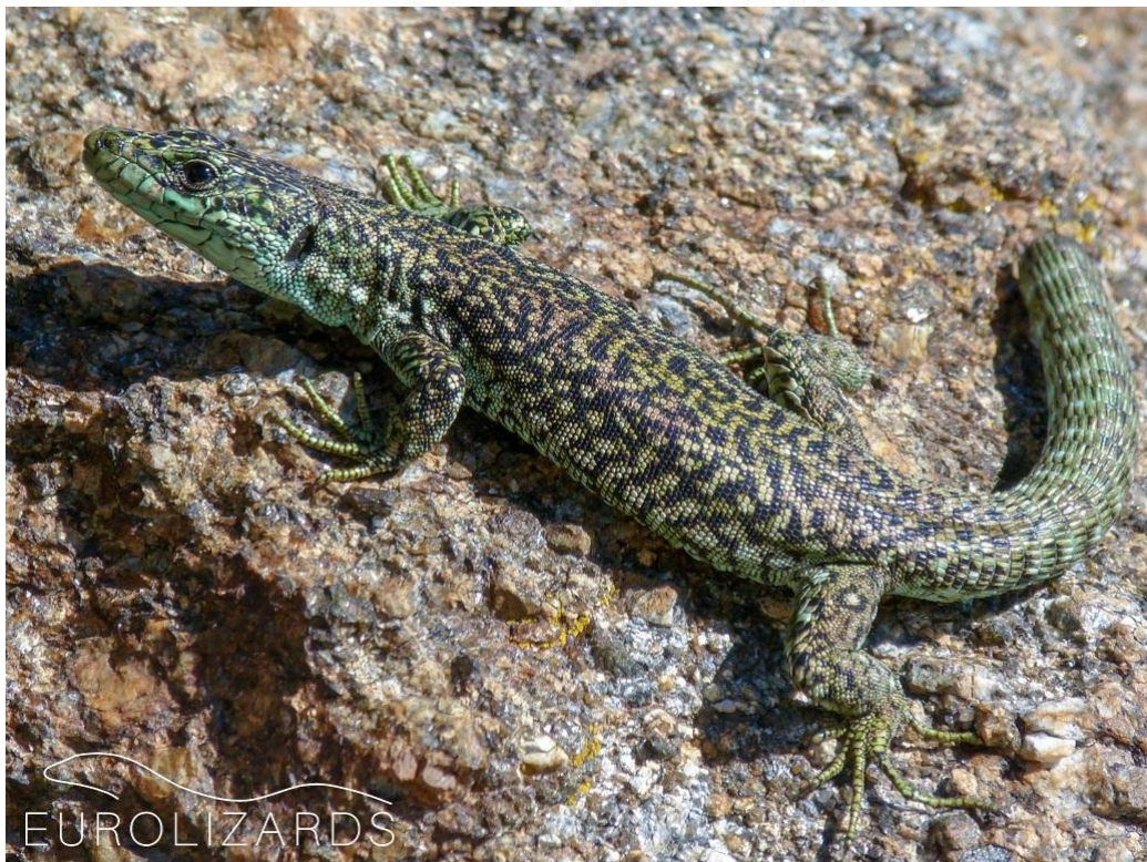
Subsp. castiliana: E / Sierra de Gredos (Ávila), 25.09.2010 - some specimens show green-reddish iridescence.