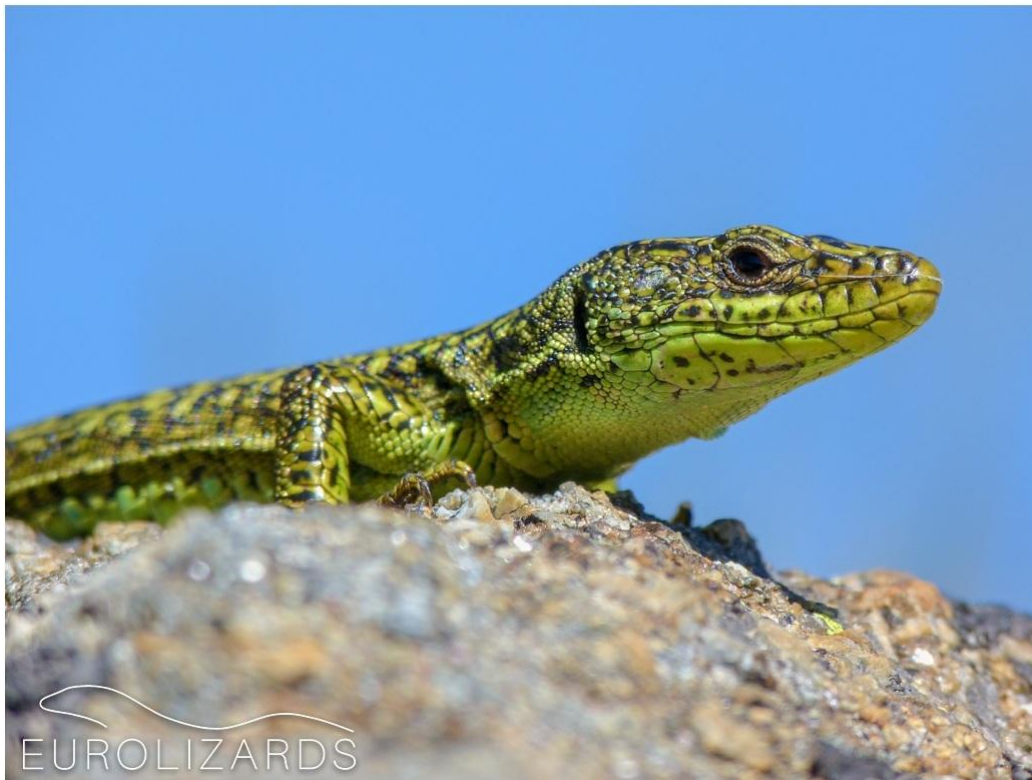
Subsp. castilliana: E / Sierra de Gredos (Ávila), 26.09.2010 - Subspecies castilliana may show bright greenish colours.

Cyren's Rock Lizard is a self-confident mountain lizard: This robust species can be seen basking on rocks during the whole afternoon. They even seem to be unimpressed by noisy groups of hikers, which may be quite numerous, as this lizard's habitats are frequented by weekend tourists from the Madrid area.