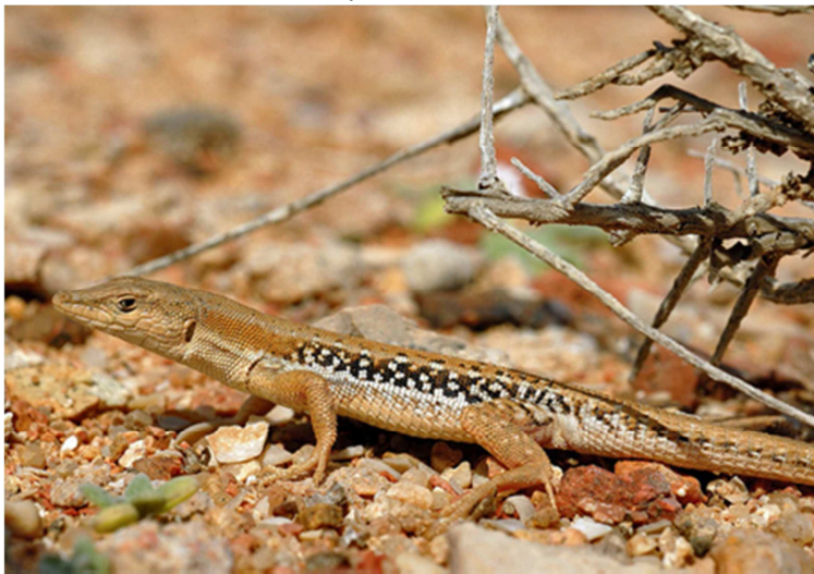
Mesalina balfouri Sindaco

Mesalina Gray, 1838 Gray, J.E. 1838. Catalogue of the Slender-tongued Saurians, with Descriptions of many new Genera and Species. Annals and Magazine of Natural History 1: 274-283, 388-394. Type species: Mesalina lichtensteini Gray, 1838