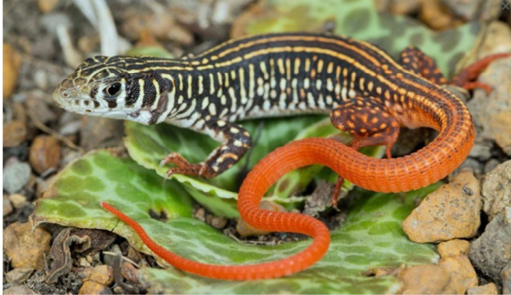
Nucras ornata Tyrone Ping

Nucras Gray, 1838 Gray, J.E. 1838. Catalogue of the Slender-tongued Saurians, with Descriptions of many new Genera and Species. Annals and Magazine of Natural History 1: 274-283, 388-394. Type species: Lacerta lalandii Milne-Edwards, 1829