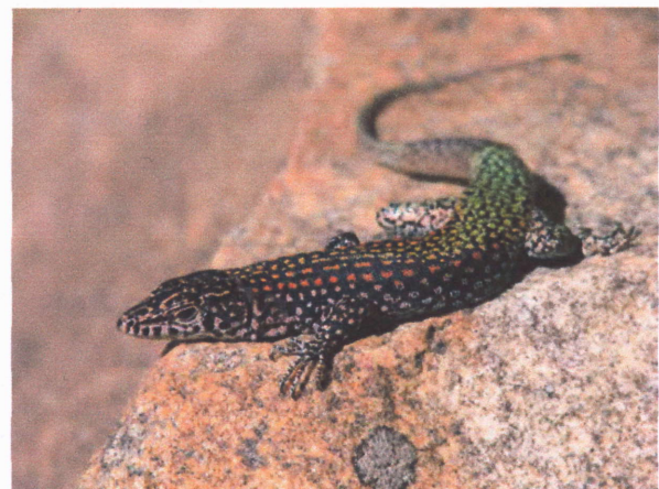
Australolacerta australis —Heuninglei, Cederberg Wilderness Area, WC P. le F.N. Mouton