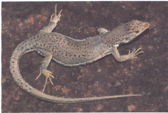
Pedioplanis burchelli, adult—Fever village, about 25 km SW of Cedarville, EC M. Burger