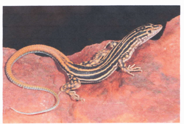
Pedioplanis burchelli, subadult—near Farm Hartbeesfontein, Nieu Bethesda area, EC