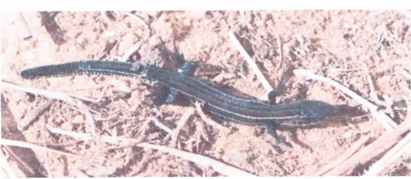
Tropidosaura essexi—Top of Chain Ladder, Drakensberg, FS M.F.

Assessment rationale: Fairly widespread and common. There are indications of intensification of grazing by stock across the Lesotho highlands and in adjacent areas of South Africa above the escarpment, including areas inhabited by T. essexi (Stewart 2001). Climate change (warming) may reduce available habitat and therefore constitutes a threat to this species, which has limited opportunity for compensatory migration. Despite these threats, there is no evidence that T. essexi has declined. It is intrinsically threatened by its relatively restricted range and the occurrence of frequent anthropogenic fires in some areas. Occurs in the same general area as T. cottrelli but is more widespread and common.