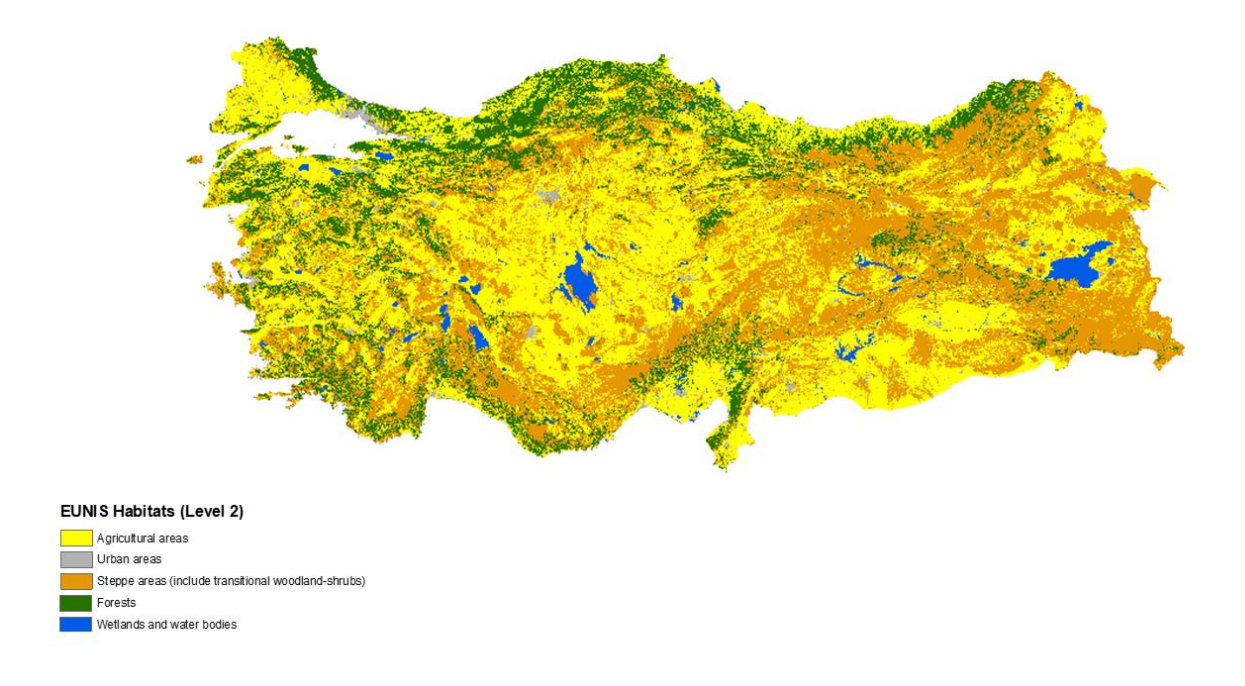
Figure 3. The general land cover types of Turkey (modified from Corine 2018)

Anatolian steppes expanded remarkably as result of cold and dry conditions during the glacial periods (Atalay, 2020). It is most likely that dwarf lizards have followed this habitat expansion. For instance, the steppes in Sultan, Emir and Murat Mountains may have enabled the lizards to extend their distribution through the LGM (Figure 2b). However, the climatic conditions in the interglacial periods (LIG, present caused contraction of dwarf lizard populations (Figure 2a, c).