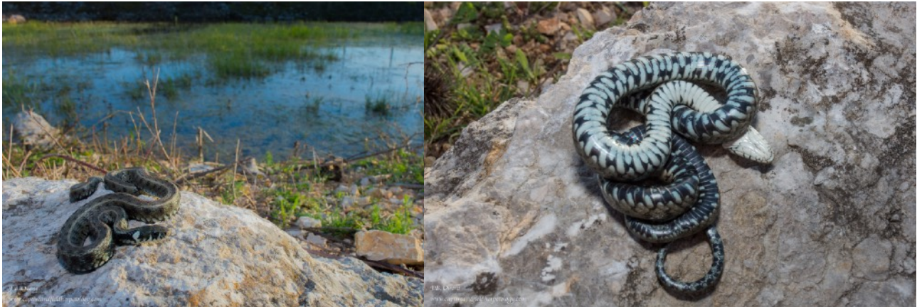
Images. Natrix natrix persa , image on right shows the individual feigning death, a common defensive strategy observed in this species.

triangulate records and reports of vipers from the island to some favourable looking rocky habitat from satellite images and found some likely looking roads and trails to get the cars close enough to hike there. We prioritised this activity for the single full day of sun we experienced on the whole trip and set off in search of the nose-horned viper. Initial expectations were high as we trekked up through unforgiving vegetation and very sharp rocky terrain to a rock strewn hillside that looked very similar to previous wide angle shots from the island (a good lesson of why not to post images with plenty of background scenery of sensitive species, we could've been poachers). After a while of scouring south-facing slopes and wind-sheltered bushes no snakes were found and even the Podarcis were thin on the ground. Once the group dropped our collective guard and splintered off a shout was carried on the wind from the opposite side of the hill and some garbled sound came through the radio. We managed to call the other group over a stable 4G signal (herping is definitely way too easy these days) and it transpired a Vammodytes had been seen but had retreated into a rock crack. We converged to find the main group sitting, staring desperately at the rocks. There was no sign of any snakes and so we began to explore around. Another Vammodytes , this time a female, was