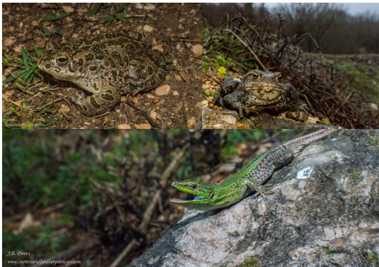
Top Left. Bufo viridis Top Right. Bufo bufo Bottom. Podarcis siculus

bags, giggling at the mostly alcoholic content (you can't take undergrads anywhere) and bizarre zoologist paraphernalia dangling from the bags. A ram's skull was unearthed from one bag (you can't take wild animals or parts thereof over the border, officially) but as it was a domestic animal the student was allowed to keep the festering memento and we were eventually on our way.