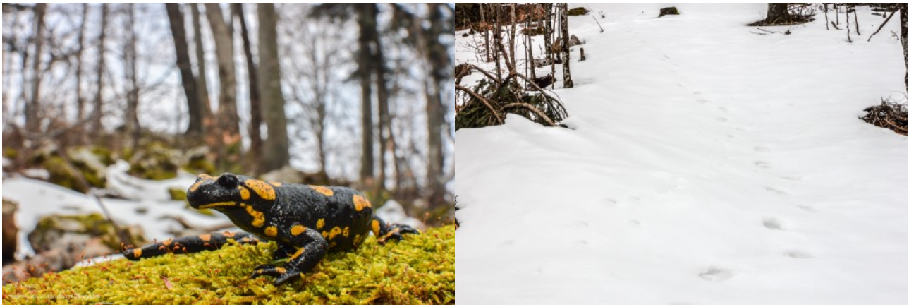
Left. Salamandra salamandra Right Bear tracks ( Ursus arctus )

higher altitude coniferous forests to try to reach a viper site given to us by the previous group. GPS coordinates showed a rocky ridge and cliff face, surrounded by verdant forest with obvious trails and tracks leading nearby. Reality gave us a single muddy logging road, bounded by knee deep snow and the hazy memories of the single veteran from the previous group, who hadn't been a driver at the time. We reached the end of the track we thought we needed and alighted, shivering, in a small quarry. The group got out to stretch their legs and another P. muralis was found and photographed. The cold tolerance of this species is astonishing as the slightest hint of slightly-less-grey clouds seemed to summon them from their rock crevices. Luckily they are very easy to photograph when unable to move at their usual rapid pace! We returned down the hill, searching for any landmarks to jog our veteran's memory of the parking space for the trail we needed, eventually reaching the suspected side road to find it blocked by a drift. Minibuses and Opel astra estates are not known for their rallying prowess and so we decided to improvise and try what had looked like another trail further up.