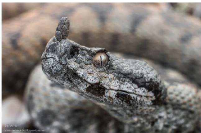
Left. Vipera ammodytes Right. Emys orbicularis