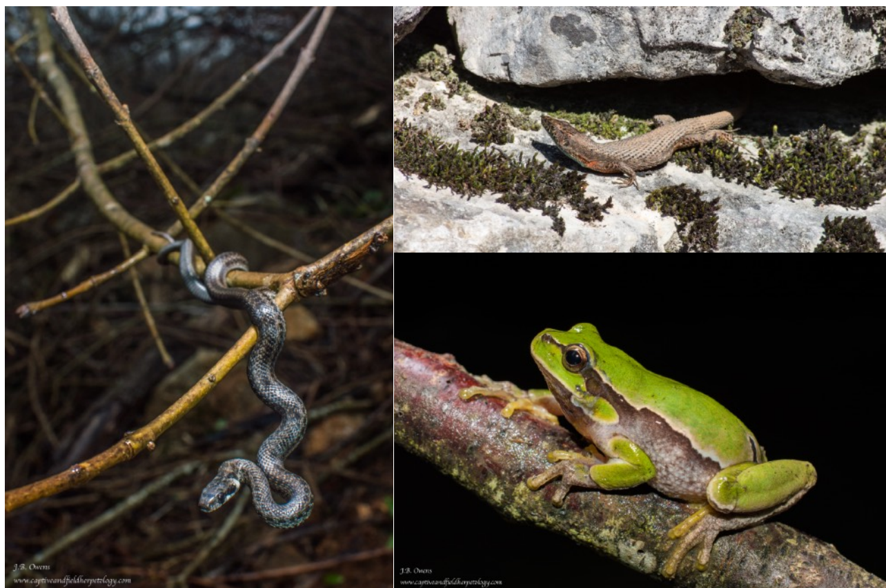
Left. Zamenis longissimus Top Right. Algyroides nigropunctatus Bottom Right. Hyla arborea

near its optimum temperature, judging by sluggish movements, which were nonetheless ample to draw blood from one unsuspecting handler. It was released after an eager photo session and we proceeded onto the picturesque island of Krk.