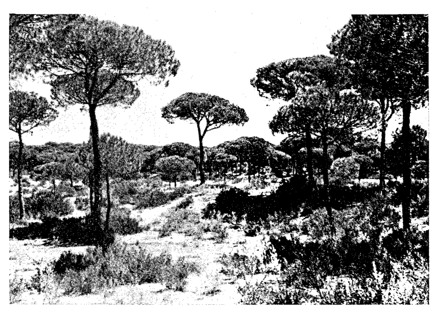
Fig. 1. Habitat of Acanthodactylus erythrurus at La Algaida (June). Pinus pinea L. (Pinaceae) stands surrounded by Juniperus phoenicea L. (Cubresaceae) provide shade. Halimium halimiifolium (L.) Willk (Cistaceae) and Corema album (L.) D. Don (Empetraceae) are used for foraging and escape from predators.

east bank of the Guadalquivir River 25.5 km (air) NW of Jerez de la Frontera, Cádiz Province, Spain, at an elevation of less than 100 m. Aridity and agriculture typify this region; present vegetation is an open evergreen formation (Fig. 1).