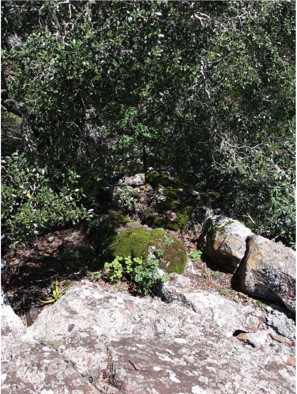
Figure 3. Typical microhabitat of Australolacerta rupicola in Sample Plot 3.

prey attacked while moving (PAM) was calculated (Cooper 2005). For each sighting, time ( t_{\text{day}} ) and temperature ( T ) were noted. Temperature was measured in degrees centigrade between 5–10 cm above the ground in the nearest shaded place to the lizard (max. 1.0 m) using a standard liquid-in-glass thermometer.