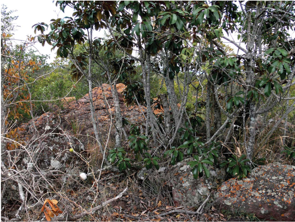
Figure 2. Typical microhabitat of Australolacerta rupicola in Sample Plot 2.

was only started when the lizard showed no apparent reaction towards the observer. Only foraging-related movements were recorded and no data were collected when there was obvious interaction with other lizards, inter- or intraspecific, or when the individual was disturbed by a predator. Possible bias owing to reproductive activities/pregnancy can be excluded since the study was conducted outside of the breeding season (Verwaijen and Van Damme 2007b; Verwaijen and Van Damme 2008). All data were recorded by one observer only.