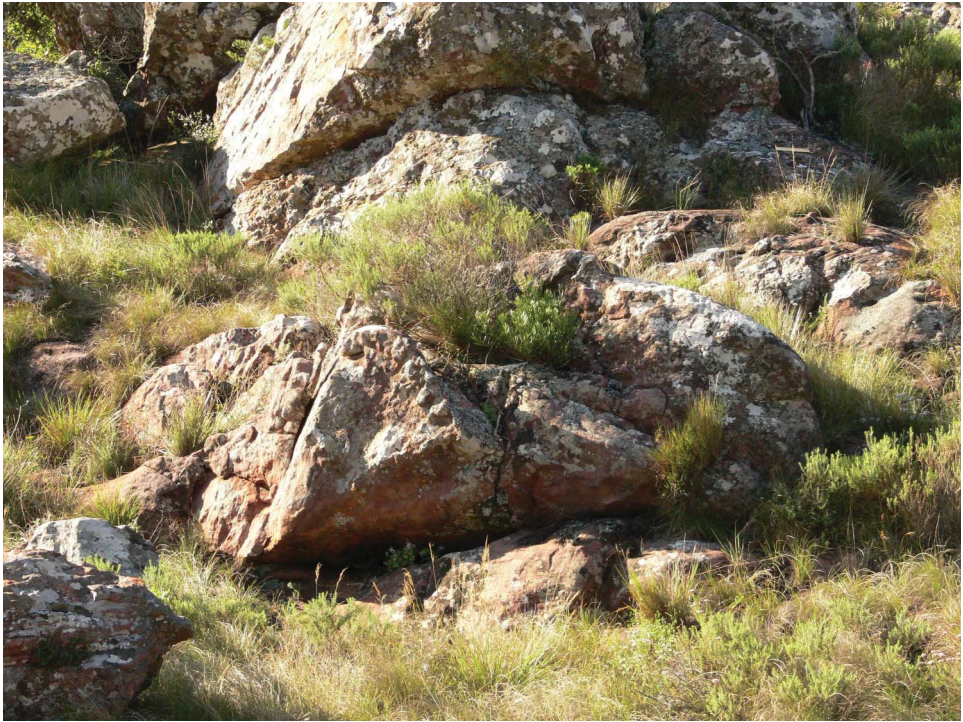
Figure 1. Typical microhabitat of Australolacerta rupicola in Sample Plot 1.

and consisted of mistbelt bush clumps with Mimusops zeyheri , Olea capensis enervis , Combretum molle and many succulents. The surveyed area also included extensions of evergreen Northern Mistbelt Forest with deeper and more developed clayey soils.