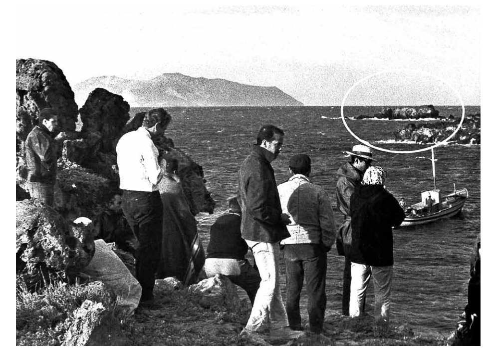
Figure 6. Lisca Nera Islet (in the white circle) view from Lisca Bianca in 1960.

ulation, in the light of the above mentioned considerations two main conclusions can be drawn: