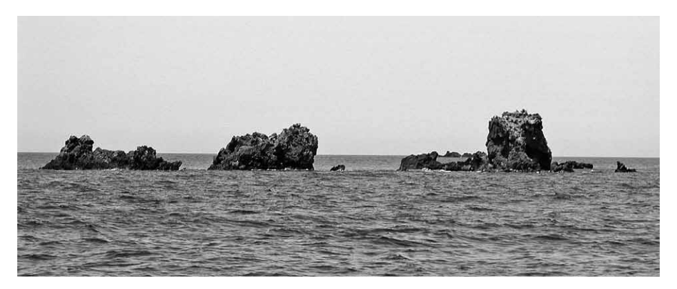
Figure 5. Lisca Nera Islet in 2006, strongly reducted in surface by erosion.

rum L., Matthiola incana (L.) R. Br. and Dactylis glomerata L., while none of the previously recorded species was found (P. Lo Cascio and S. Pasta, unpubl. data). Within the islets' group located East off Panarea, Lisca Nera is certainly the one that over the last century underwent the most dramatic and fast surface reduction due to erosion (Fig. 5). Besides of the waves, the whole area is affected by intense gas emissions related to the presence of a submarine volcano which significantly increased since 2002 (Aliani et al., 2010). During normal degassing activity periods, the chemical composition is that typical of a hydrothermal environment, rich in CO_2 and H_2S , but in its cyclic crises it becomes strongly acidified by magmatic compounds, such as SO_2 , HCl and HF (Capaccioni et al., 2010). This, in a long-term perspective, contributed to alter the physical-chemical features of the dacitic-andesitic lavas of the islets, emphasizing the erosive processes.