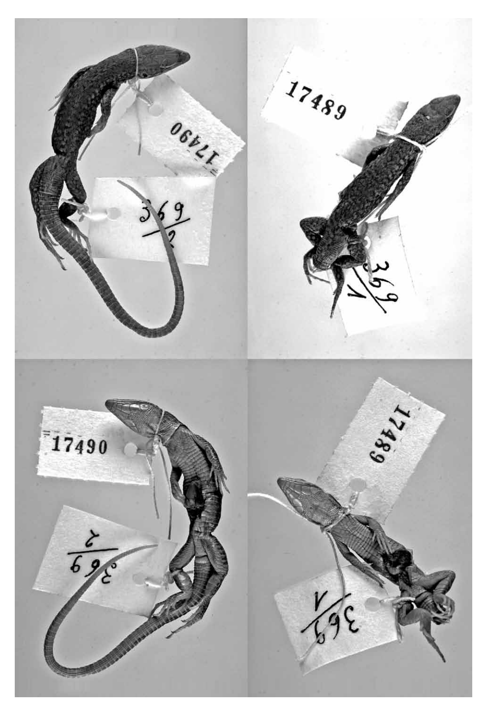
Figure 3. The sub-adult female specimens collected by E.H. Giglioli in 1878 (MZUF coll. n. 17489 and 17490).