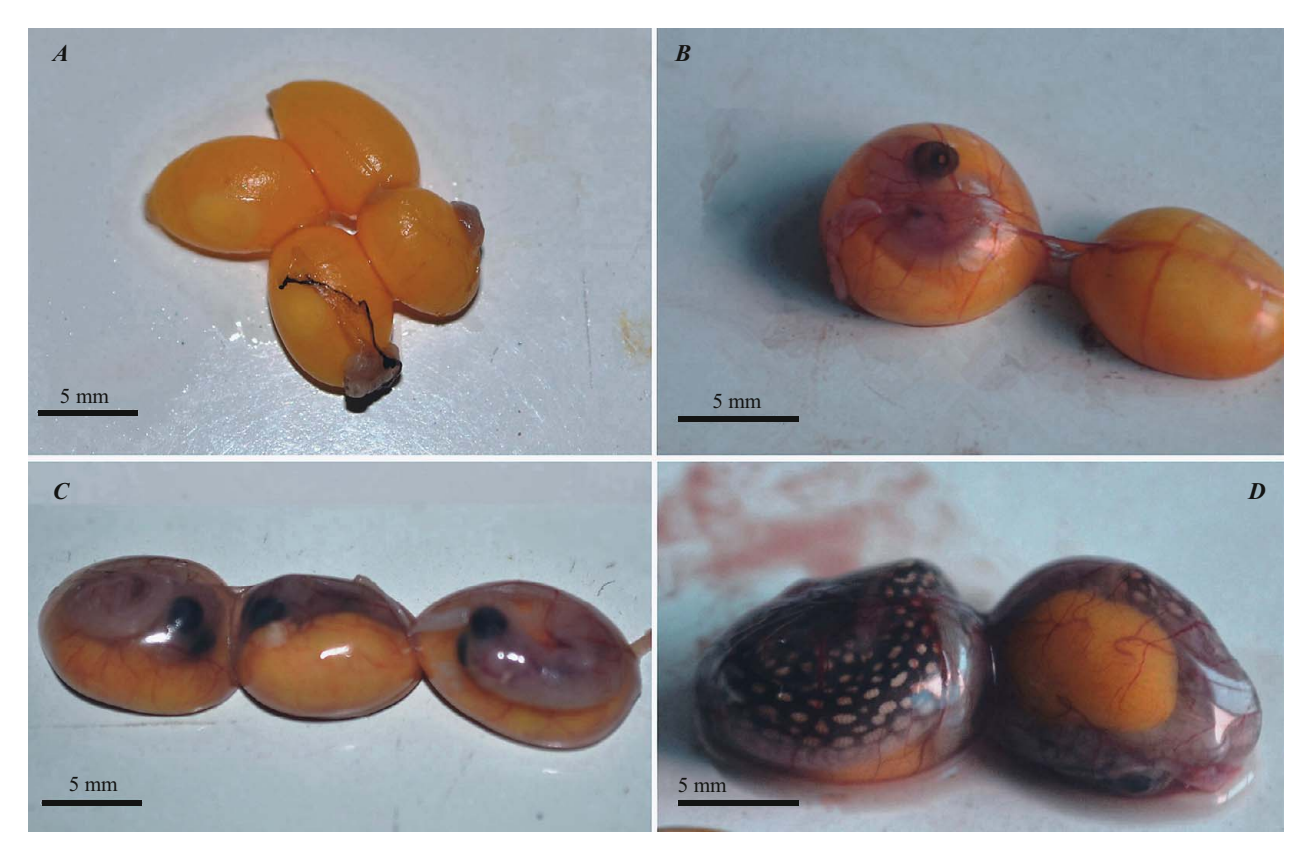
Fig. 1. Morphology of developing embryos at different stages: A, no remnant eggshell before embryo development, near postzygote stages; B, the vessels develop at early pregnancy (stages 30 - 31); C, yolk mass significantly decreases at middle pregnancy (stages 34 - 35); D, the fetus develops completely at late pregnancy (stages 38 - 40).

Vessels still existed and covered the whole egg. The embryo had developed into a complete fetus with eyes closed (Fig. 1D). Fetus was surrounded with amniotic fluid. Fetal heartbeat was much stronger. Stripe turned into grey for the neonates.