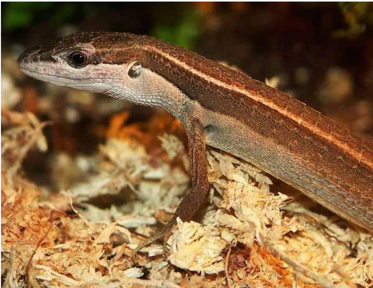
Female T. sexlineatus ; image by Acapella, licensed under Creative Commons Attribution-Share Alike 3.0 Unported license.

Some Takydromus species are forest-dwelling lizards while others occur in open habitats and show a preference for climbing among tall grasses. In fact, some are mostly ground-dwellers (e.g., T. amurensis and T. sylvaticus ) while others are highly agile, acrobatic climbers that wind their tails around branches or grass blades when climbing. The more proficient of the climbers (like T. sexlineatus and T. dorsalis ) are able to project the body stiffly outward from the object they're climbing, the forelimbs laid back against the flanks (Arnold 1997). Bipedal standing, again with the forelimbs flat against the body, is practised in the longer-tailed species (like T. sexlineatus ) when they're trying to catch airborne or elevated prey. Arnold (1997) described this pose as 'penguin-like'. He also suggested that the large, continuously overlapping dorsal and ventral scales might help provide stiffness for the body when the animals stand in this pose.