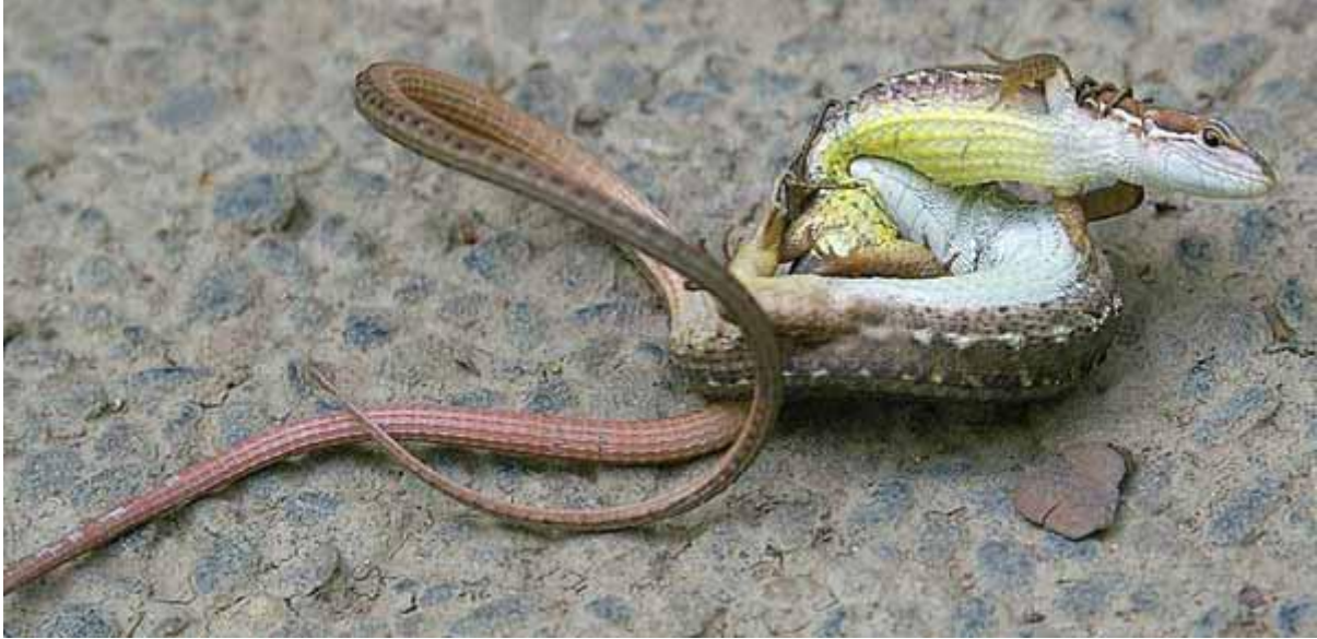
Two fighting male individuals of Japanese grass lizard ( Takydromus tachydromoides ). UPDATE: err, or is that a male and female engaged in courtship?

The views expressed are those of the author and are not necessarily those of Scientific American.