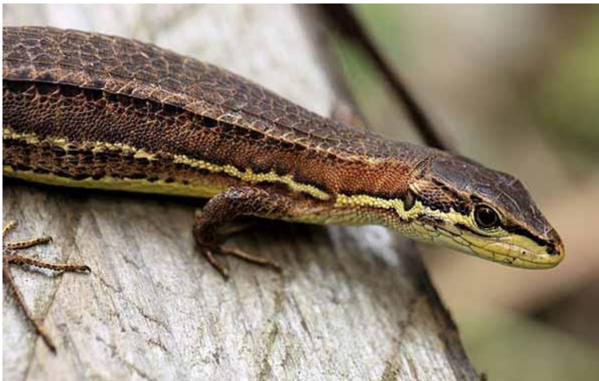
Another view of another Japanese grass lizard ( T. tachydromoides ).

Arnold (1997) provided a wealth of data on the anatomy of the Takydromus species and produced a morphology-based phylogenetic hypothesis for the clade. As is typical for species that contain numerous species, there have been suggestions from time to time that certain of said species should get their own genera, so both Platyplacopus Boulenger, 1917 and Apeltonotus Boulenger, 1917 are today regarded as synonyms of Takydromus . Arnold (1997) found Takydromus to group into two main clades and he hence suggested that the name Platyplacopus could be applied to the clade that includes its type species ( T. keunei from southern China, Hainan and Taiwan). However, molecular phylogenies have not supported this tidy division and Platyplacopus now seems to be polyphyletic (Lin et al. 2002, Ota et al. 2002).