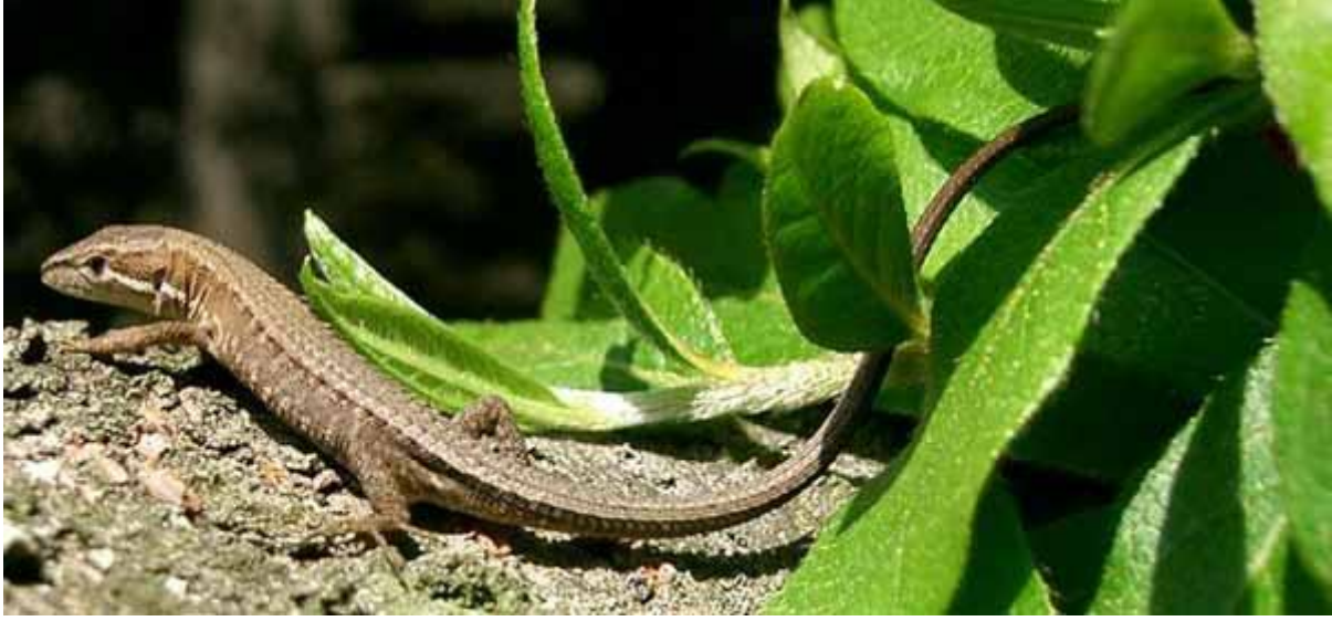
Another Japanese grass lizard ( T. tachydromoides) (this species was also reported in 1958 from South Korea)

If you know squamates, you'll know that hemipenis structure is important in working out how species might be related to another. Surprise surprise, Takydromus has weird hemipenes: the lobes at the tips are unusually thick-walled and – so far as we know – the hemipenes don't change shape much across the seasons. Oh yeah, did I say that squamate hemipenes normally change in size and shape according to season? As you might predict, they are biggest and most elaborately ornamented during the breeding season.