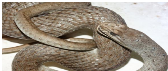
Plate (7): Malpolon monspessulana ; North of Basrah province.

This large opisthoglyphous snake is with back fang mildly poisonous, adult about more than 150cm in length, its uniform color of dark olive or gray, that differs from northern population of M. monspessulana insignita (Geoffroy St. Hilaire,1809) which is spotted laterally and green in color (Afrasiab and Mohamad, 2011); that recognize by convex head, with two loreal scales and 17 dorsal scale rows.