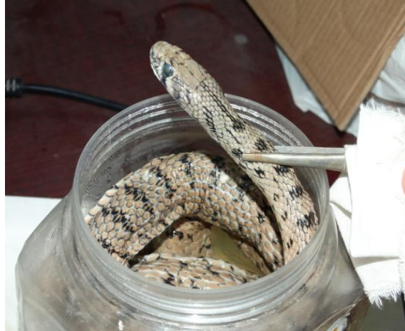
Plate (3): Platyceps ventromaculatus ; from North of Basrah province.