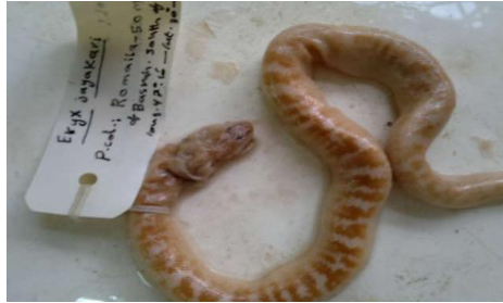
Plate (14): Eryx jayakari ; Rumaila desert, west of Basrah province. (Preserved in INHRCM)

This snake has been recorded from Rumaila desert by Afrasiab and Ali (1989a). It is recognized by position of the eyes visible from above, presence of mental groove 37-51 dorsal scale rows.