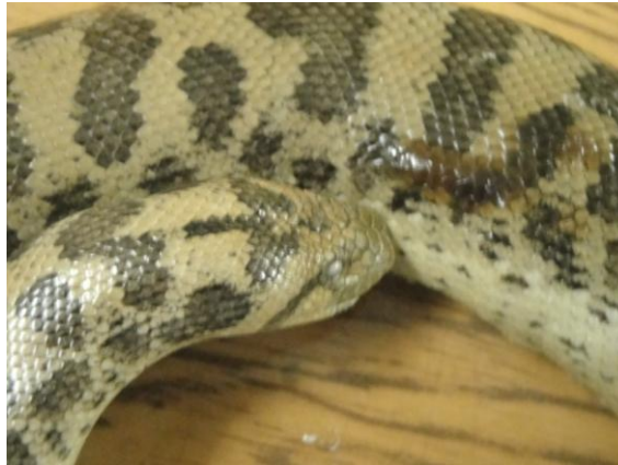
Plate (2): Eryx jaculus jaculus ; from North of Basrah province.

Eryx jaculus jaculus (Linnaeus,1758) (Pl. 2, 8)