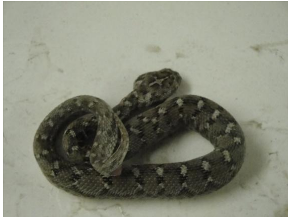
Plate (9): Echis carinatus sochureki ; North of Basrah province.