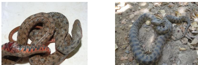
Plate (6): Natrix tessellata tessellate ; Right dark phase, left reddish phase, from North of Basrah province.