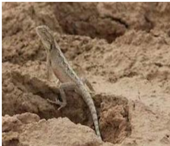
Plate (12): Trapelus persicus fieldi ; Rumaila desert, West of Basrah province.

1- Trapelus persicus fieldi (Hass and Y. Werner, 1969) Afrasiab and Ali (1989a) (Pl.12)