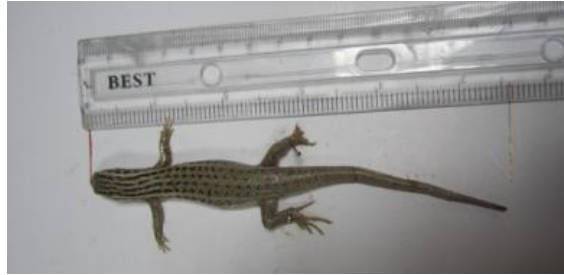
Plate (5): Mabuya aurata septemtaeniata ; from North of Basrah province.

Some authors regarding M. septemtaeniata a separate species from M. aurata (Leviton et al. , 1992; Rastegar-Pouyani et al. , 2008); others mention it as a subspecies of aurata (Khalaf, 1959; Mahdi and George, 1969). This Mabuya (= Trachylepis ) is recognized by parietal scales not in contact and having smooth nuchals.