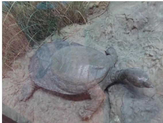
Plate (10): Rafetus euphraticus ; mounted specimen in the exhibition hall of the INHRCM.

Rafetus euphraticus (Daudin, 1802) (Pl.10)