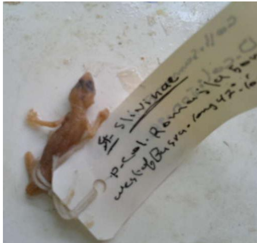
Plate (11): Stenodactylus slevini ; from Rumaila desert western Basrah province (Preserved in INHRCM)

1- Stenodactylus slevini Haas, 1957 (Pl.11)