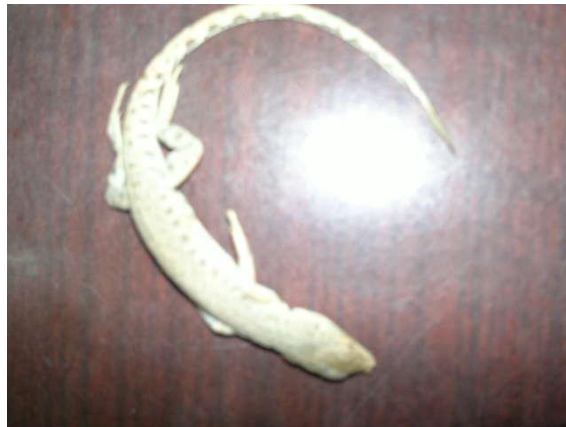
Plate (1): Preserved specimens of M. brevirostris ; collected from the North of Basrah province.

2- Mesalina brevirostris Blanford, 1874 (Pl. 1)