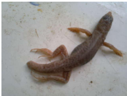
Plate (13): Acanthodactylus schmidti ; Rumaila desert west of Basrah province (from collection of INHRCM)

1- Acanthodactylus schmidti Haas,1957 (Pl.13). This is one of the beautiful lizards in this area. It is recognized by 3 large supraoculars, the forth is divided into dorsolateral scale larger than mid-dorsal scales 12-16 ventral plates and 32-54 keeled dorsal scale rows.