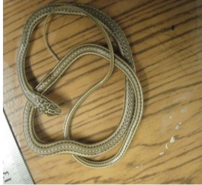
Plate (16): Psammophis schokari ; Rumaila west of Basrah province.