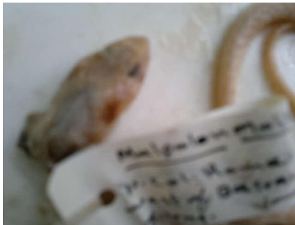
Plate (15): Malpolon moilensis ; Rumaila desert (Preserved in INHRCM).

This snake when feels a danger will raise the anterior part of the body as in cobra; dorsal scales are smooth in 17 rows. Head is convex with two black spots on each side, it is opisthoglyphous.