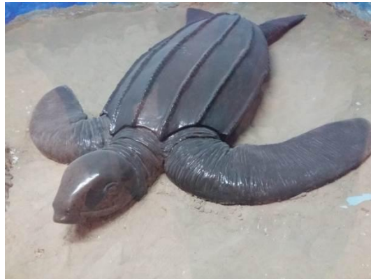
Plate (18): Dermochelys coriacea ; plaster model in the INHRCM (It is a copy of real one dead in Basrah province).