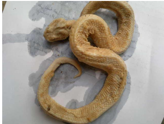
Plate (17): Cerastes cerastes gasperettii ; From Rumaila desert west Basrah province ( Preserved in INHRCM).

In the same area, this is a poisonous horned viper; some individuals have horns while others without horns; most of the day time it is hidden under the soft sand or bushes.