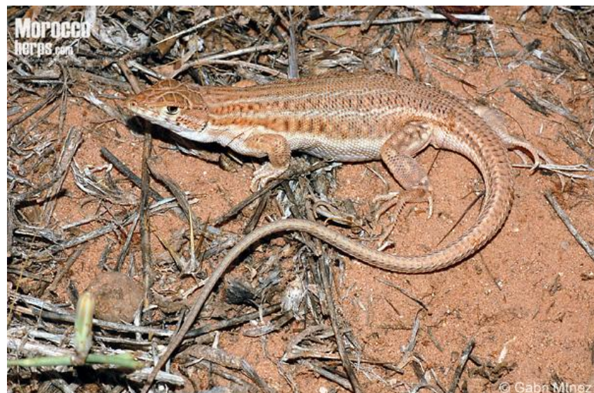
Gravid female Acanthodactylus boskianus . Ouarzazate (Morocco).

It is eminently terrestrial. It digs burrows, frequently with several entries, either in sandy but compact land or below the roots of a shrub.