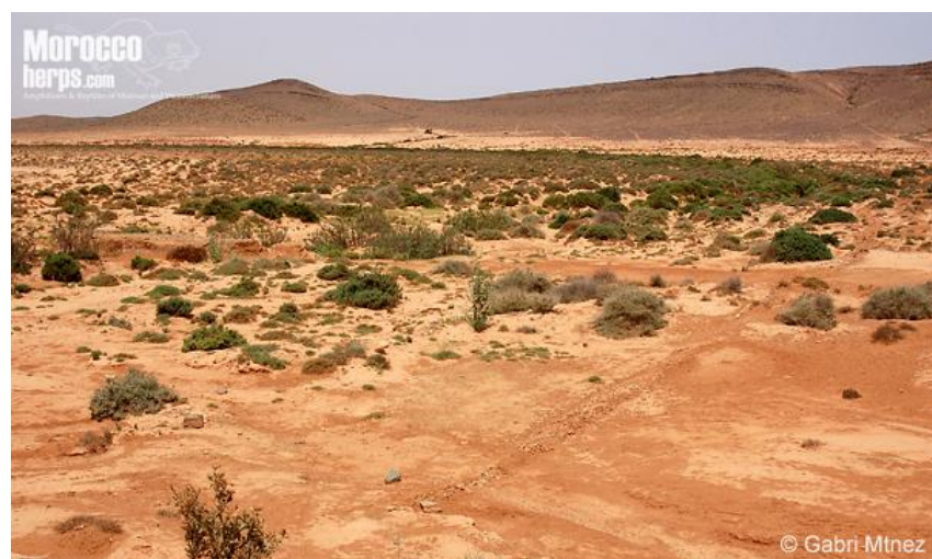
Habitat of Acanthodactylus boskianus . Guelmin (Morocco).

It mainly inhabits arid and semiarid regions, reaching the northeaster coast through the Muluya's depression. It is considered as the only ubiquitous saharan member within the moroccan herpetofauna (Bons & Geniez, 1996). It mainly inhabits flat terrains with scattered bushes and no tree layer. It can be found in coastal dunes and other not excessively vast sandy formations with little vegetation and close to regs, bed of oueds, nearby oasis and desertic steppes (Fahd & Pleguezuelos, 1996; Geniez et al. , 2004).