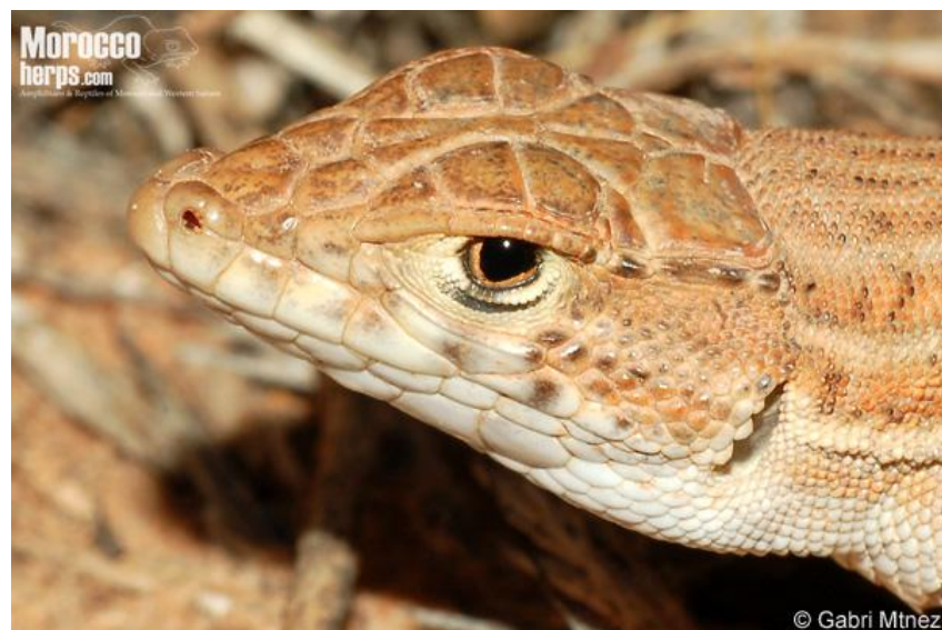
Head detail. Ouarzazate (Morocco).

Like others species within the genus, scales from the temporal region get gradually smaller toward the parietal region. There are 32 to 40 lines of dorsal scales in half of the body, being keeled and overlapping each other, growing in size and getting more prominent toward both the posterior part of the body and the base of the tail. Costal scales are granular. Ventral scales are wide and placed in 10 longitudinal bands, rarely 12 or 14; the number of femoral pores ranges from 19 to 26 (Schleich et al. , 1996).