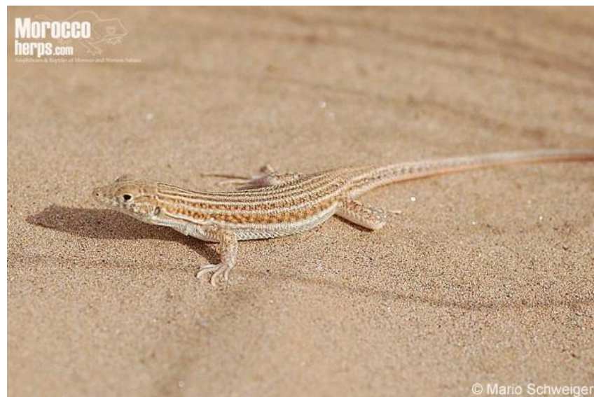
Adult female. Ouarzazate (Morocco).

Standard-size lizard, being one of the species that reaches longer total length within the genus Acanthodactylus ; males are around 250 mm while females are around 205 mm (Schleich et al. , 1996; Geniez et al. , 2004). It usually has 4 supraoculars, a line of small granular scales penetrating between the third and the fourth supraocular generally shows up between the supraoculars and the supraciliaris. It usually has 4 supralabials preceding the infraocular. Scales preceding the ear show denticular shape.