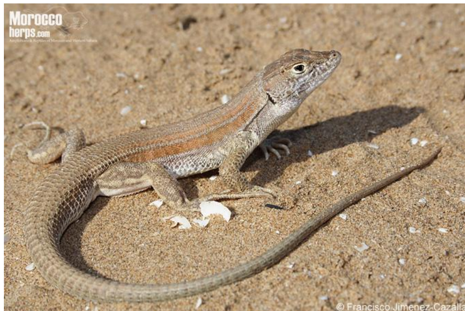
Adult male. Saïdia. (Morocco).

Taxonomy: Sauria | Lacertidae | Acanthodactylus | Acanthodactylus boskianus