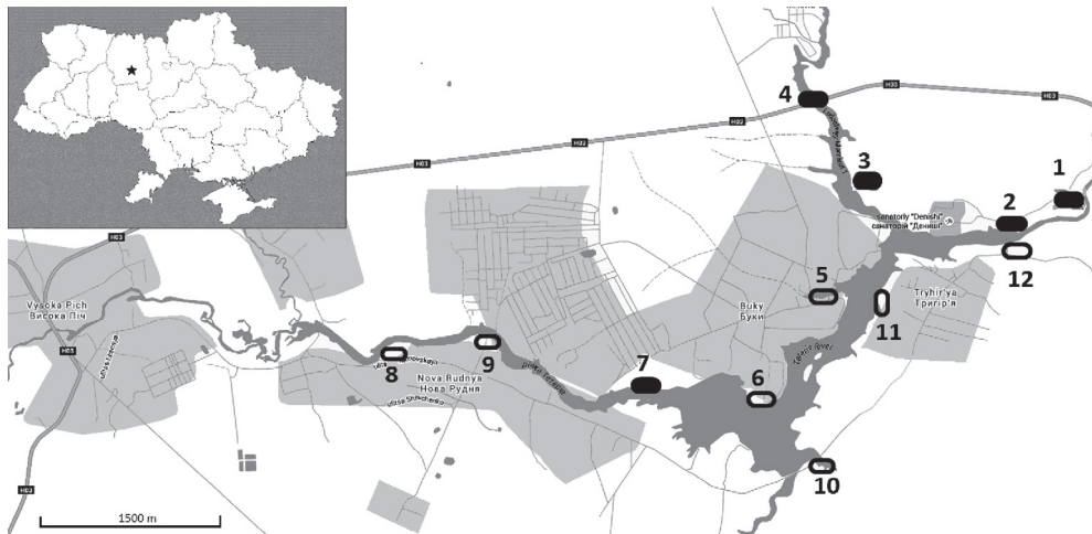
Fig. 2. List and location of the studied sites: 1 — cliffs to east of the resort Denysy (28.39 E, 50.20 N); 2 — dam across the Teteriv River near the resort Denysy (28.38 E, 50.20 N); 3 — river bank to the west from the UVD resort (mouth of the Bobrovka River; 28.36 E, 50.21 N); 4 — bridge over the Bobrovka River (28.36 E, 50.21 N); 5 — bay in Buky Village (28.36 E, 50.20 N); 6 — cape in Buky Village (28.35 E, 50.19 N); 7 — cliffs between Buky Village and country houses (28.34 E, 50.19 N); 8 — river bank in Rudnya-Nova Village (28.30 E, 50.19 N); 9 — cape in Rudnya-Nova Village (28.32 E, 50.19 N); 10 — bridge over the Glubochok River (28.36 E, 50.18 N); 11 — river bank in Tryhirya Village (28.37 E, 50.19 N); 12 — right bank of the Teteriv River near dam (28.38 E, 50.20 N). Sites where lizards were found are marked by black color.

bridge were found about 10 juvenile D. armeniaca . Thus in total, length of the distribution area of the species is about 3.7 km (distance between sites 1 and 4).