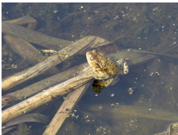
Fig. 4 – Bufo bufo , adult male, Sâi, 2012;