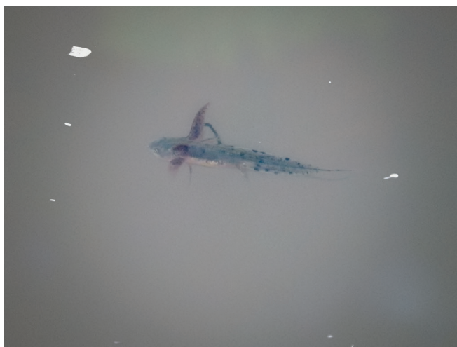
Fig. 1 – Triturus cristatus larva, Drăgăneștii de Vede, 2015;

The only species firstly recorded for this county is Bufo bufo ( Pelobates syriacus , recorded from areas close to Teleorman – see, e.g., Székely et al., 2013 – is also known to be present in the area from unpublished data – V. Cioflec, pers. comm.). We did not find Darevskia (praticola) pontica and Eryx jaculus ; however, given that the records of these species are recent and certain, and thus in no need of confirmation, we did not prioritize their search. We neither found „pure” Triturus dobrogicus (i.e. with no morphological evidence of introgressive hybridization with T. cristatus ), nor Ablepharus kitaibelii , nor Natrix tessellata . If Triturus dobrogicus and Ablepharus are