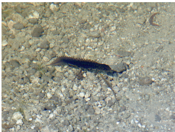
Fig. 2 – Lissotriton vulgaris , adult male, near Blejești, 2013;