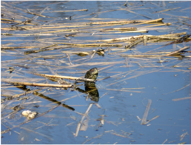
Fig. 6 – Emys orbicularis , adult, near Zimnicea, 2014.

In the case of Crested Newts (the Triturus cristatus species group) we found a population (north from Videle) in which the morphology indicates hybrid origin, i.e. introgressive hybridization between T. cristatus and T. dobrogicus , a phenomenon known to the east of this area, in Giurgiu and Ilfov (see, e.g., Arntzen et al., 1997; Cogălniceanu et al., 2000; Iftime & Iftime, 2008). In this population some specimens appear morphologically closer to T. dobrogicus , while others to T. cristatus .