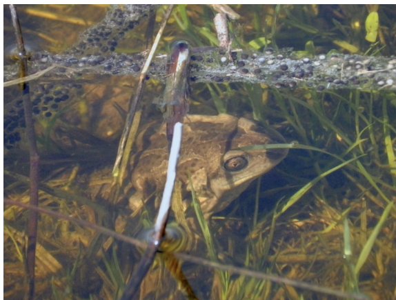
Fig. 3 – Pelobates fuscus , adult with egg string, Baci, 2014.