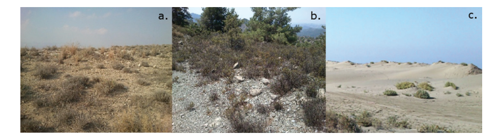
Fig. 1. — The three sampling habitats: (a) Geri, (b) Agros, (c) Akrotiri.

We captured individuals from three populations (Geri: 35°05′50″N, 33°26′21″E, elevation 183 m a.s.l. (above sea level); Agros: 34°56′27″N, 33°00′14″E, elevation 1348 m a.s.l.; Akrotiri: 34° 36′33″N, 32°55′45″E, elevation 1 m a.s.l.) that differ considerably in terms of habitat. The Geri habitat is a sub-urban shrubland with many medium-sized rocks and low stone piles on fine-grained soil (Fig. 1a). The habitat in Agros comprises meadows with shrubs, grasses, herbs and rocks in a Turkish pine forest ( Pinus brutia ) (Fig. 1b). Akrotiri is located in a coastal sand dune system with sparse low shrubs (Fig. 1c).