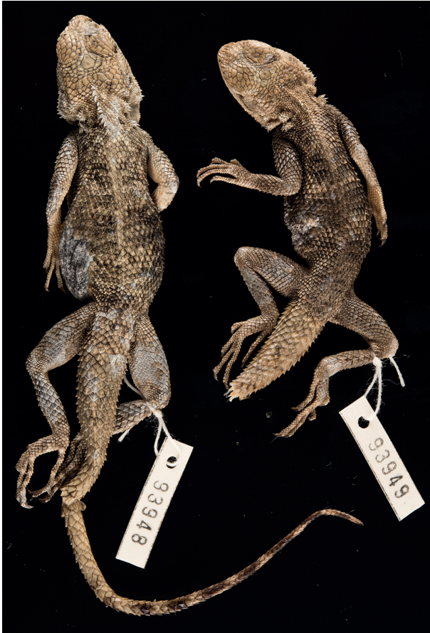
Fig. 9. Agama sp. from Dérégoué, Burkina Faso. Left: male, and right: female.

southeast. Recorded also for the Burkina Faso part of the RBTW in the east of the country (Chirio 2009).