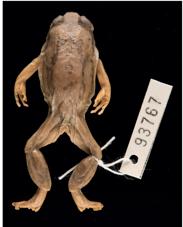
Fig. 4. Leptopelis bufonides from between Douentza and Boni, Mali.

A comment to be made on this widely distributed and common species refers to the generic nomenclature. After the partition of the collective genus Bufo , the Afrotropi-