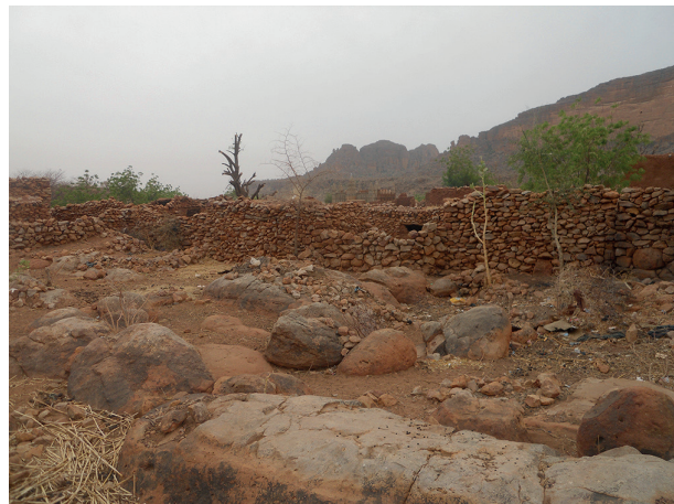
Fig. 3. Pergué village, Mali.

The area between Douentza and Bandiagara was visited several times, in 2009 (September), 2010 (July) and in 2011/2012, in the course of Dogon linguistic studies carried out by Jeffrey Heath in the Dogon Province. Some amphibians and reptiles were seen, photographed and – by focal sampling – collected. These voucher specimens are deposited in ZFMK's herpetological collection, as are the photographs in ZFMK's herpetological photo archive.