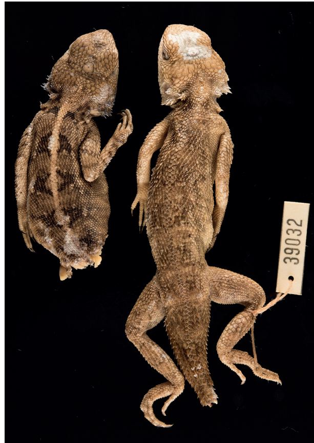
Fig. 8. Agama sankaranica from NE of Dérégoué (left) and from Ouagadougou (right), Burkina Faso. Note the absence of a light vertebral line in the right specimen.

The taxonomy of this widespread and anthropophilous lizard is complicated, since it represents a species complex of closely related forms. Moreover, its Linnean type series, composed of three different species, has been differently interpreted by Wagner et al. (2009) and by Medinnikov et al. (2012). In the light of the results by Leaché et al. (2014) we follow the concept of the former authors.