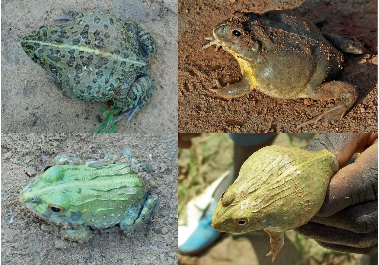
Fig. 7. Four specimens of Pyxicephalus sp. from between Mopti and Sévaré, Mali, to show the variability in color pattern. The specimen on lower left is a juvenile (not on scale).