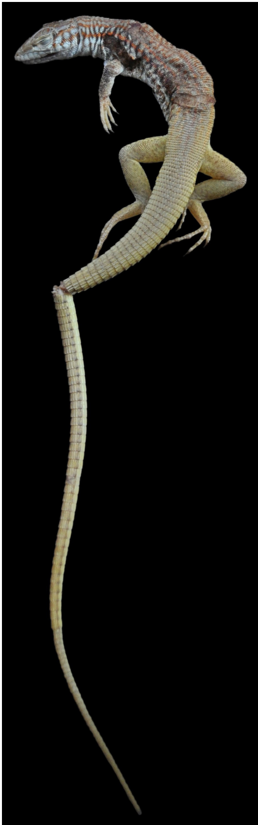
Fig. 13. Latastia longicaudata from Douentza, Mali.