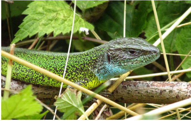
FIGURE 1 Adult male of the eastern green lizard Lacerta viridis in Passau, Germany.

higher influence of vegetation structure in the microhabitat selection in the northern periphery, where the availability of suitable habitats for the species is a limiting factor, while in the core, where the available range of habitats is broader, abiotic parameters will have a higher influence in the microhabitat selection.