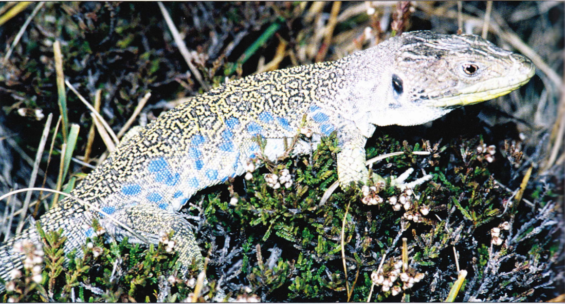
Fig. 89: Timon lepidus , Savona province, Liguria.