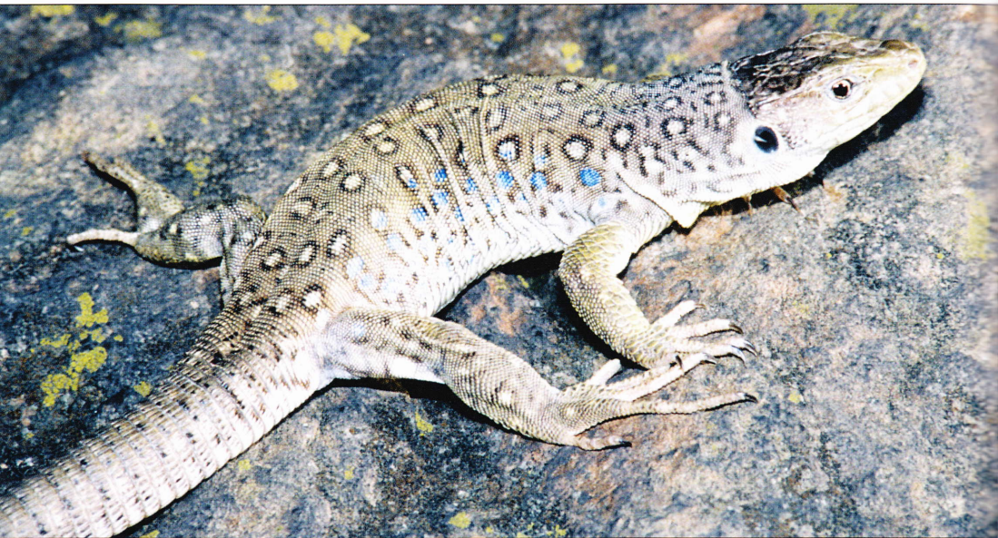
Fig. 90: Timon lepidus , Côte d'Azur, France.