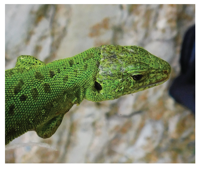
Figure 6. Lacerta agilis ioriensis Peters et Muskhelischwili, 1968, Tianeti village (ZISP № 29878) (photograph by I. V. Doronin and M. A. Doronina).

September 1, 2009, R. Nessing (2011) was able to find only 3 specimens.