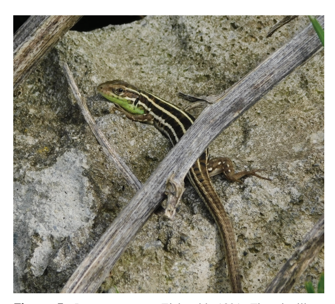
Figure 5. Lacerta strigata Eichwald, 1831, Tianeti village.

Note. L. (Longitudo corporis) – length of body from tip of snout to cloaca; L. cd. (Longitudo caudalis) – tail length: [–] tail regeneration or missing; Pil. (Pileus) – length from the tip of snout to the posterior edge of the parietal shields; Lt. c. (Latitudo capitis) – maximum width of head; Al. c. (Altitudo capitis) – head height near the occipital scales; Mas. (Masseteric) – the presence and size of the central temporal scale: [++] very large, [+] large, [(+)] mid-sized; Mas./Tym. (Masseteric/Tympanum) – the number of scales along the most narrow distance between the central temporal and drum scales; Sup. gran. (Supraciliary granules) – the number of granules between the supraoculars and superciliaries scales; Sup. (Supratemporalia) – the number of scales along the edge of the parietal shield for supratemporals; G. (Gularia) – the number of gular scales line between the middle of the collar and a compound mandibular scales; Sq. (Squamae) – the number of dorsal scales in a transverse row around the middle of the body; P. fm. (Pori femoralis) – the number of femoral pores; Pr. an.1 (Scuta preanalia) – the number of preanal scales in the front row; Pr. an.2 – the number of enlarged preanal scales.