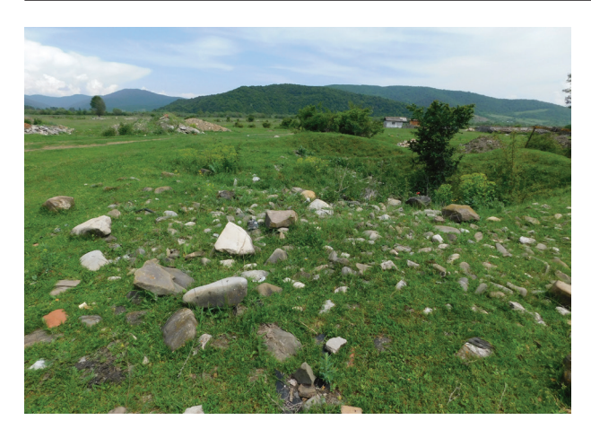
Figure 7. The valley of the Iori River in the Tianeti village.

(following the classification of populations of this species in the monograph Yablokov 1976), making this one of the rarest taxa in the genus Lacerta . In our opinion, the main natural limiting factors for this subspecies are the severe mountain climate and competition with L. strigata. We identified an anthropogenic factor causing destruction of its habitat, namely extraction of sand and rubble from the river valley. Due to its limited distribution and small population size, this lizard is very vulnerable and can rapidly disappear under adverse conditions. The effective method of protection could be the use of zoo culture and the creation of new populations through the reintroduction of captive bred lizards. Although this is a promising direction for protection of the herpetofauna (Ananjeva et al. 2015), we believe that the most effective conservation can be achieved through the creation of a protected area at this territory and a long-term monitoring of this population.