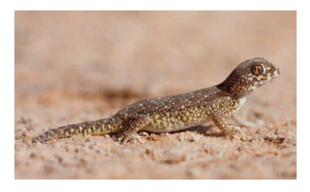
Figure 2. A specimen of Stenodactylus sthenodactylus from El Bessila (Kneiss Archipelago).

Previously recorded for El Gataïa El Bahria by Tlili (2003), although this locality has not been successively mentioned by Tlili et al. (2012b). The species (Fig. 2) has not been detected on the islet during our survey, but several habitats seem to be potentially suitable for this gecko, which is characterized by nocturnal activity and elusive behavior. One specimen was instead found in a diurnal shelter at El Bessila, despite the nocturnal survey we performed. This observation represents the first record of the species for the Kneiss Archipelago. On this islet S. sthenodactylus seems however rare