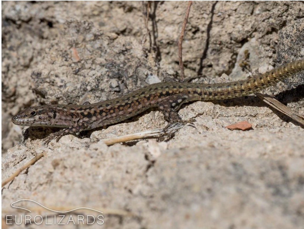
Female: E / Sierra de Cazorta, 30.10.2017 - Females may show continuous light dorsolateral lines or rows of light dots, instead.