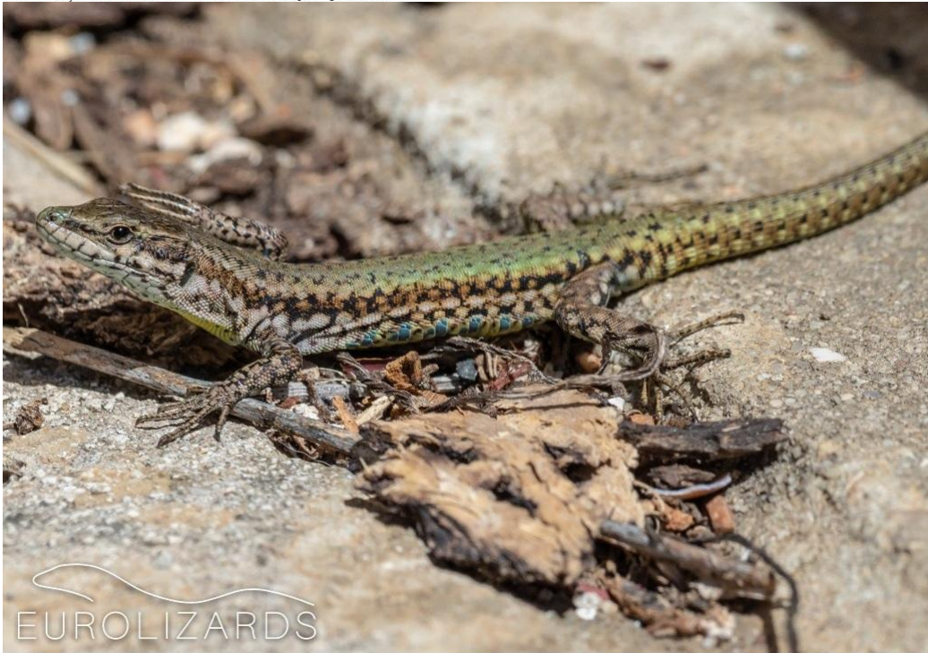
Male: P / Monchique (Algarve), 16.04.2017 - Note the greenish back and the absence of a vertebral line.