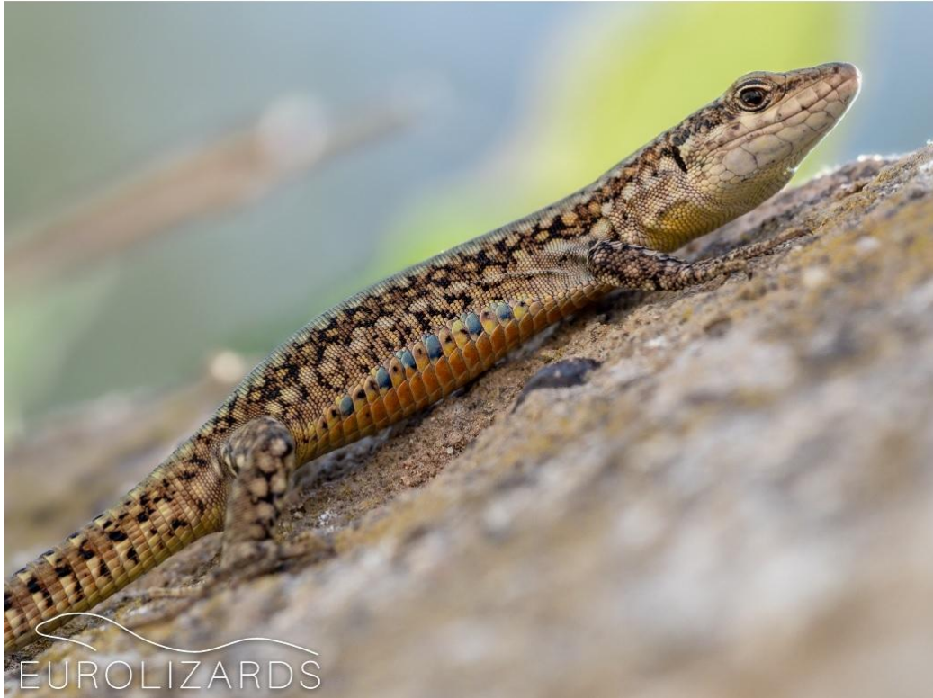
Male displaying its yellow-orange underside and blue outer ventral scales: P / Monchique (Algarve), 17.04.2017

Podarcis virescens is another 'generalist' in the Podarcis hispanicus group. In the Sierra de Cazorta (Jaén) it inhabits rocky mountain areas but it was also able to populate the endless agricultural plains of Castilla-La Mancha where it can be found on bridges or buildings - A quite successful species, regarding its wide distribution area from the Portuguese Atlantic Coast to the Baetic System.