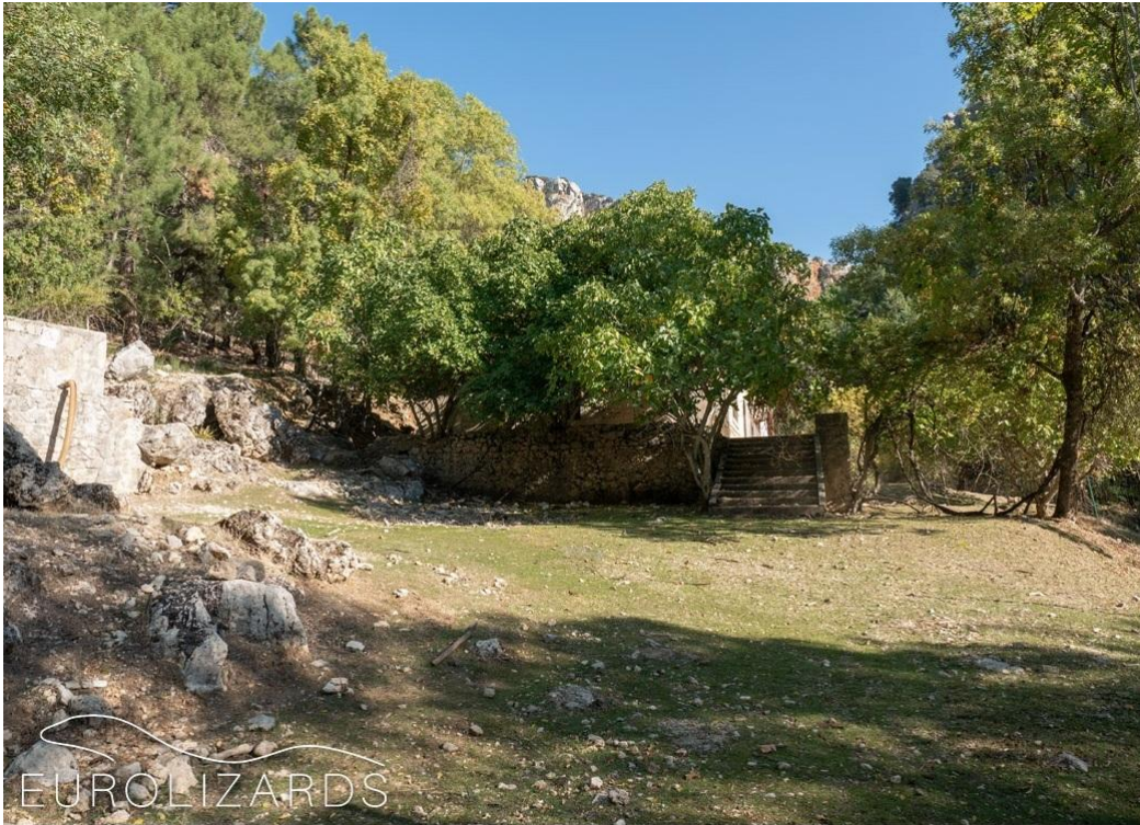
Habitat of Podarcis virescens and Alavroides marchi : F / Sierra de Cazorta 30.10.2017