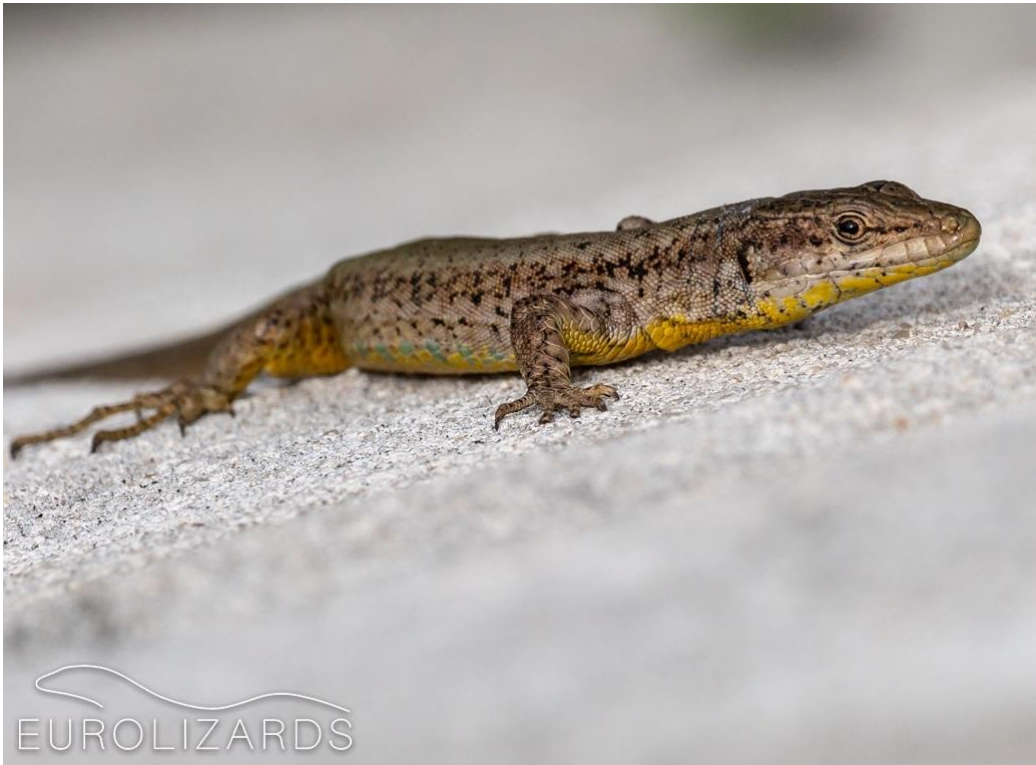
Male with yellow underside: P / Sines (Alentejo), 19.04.2017