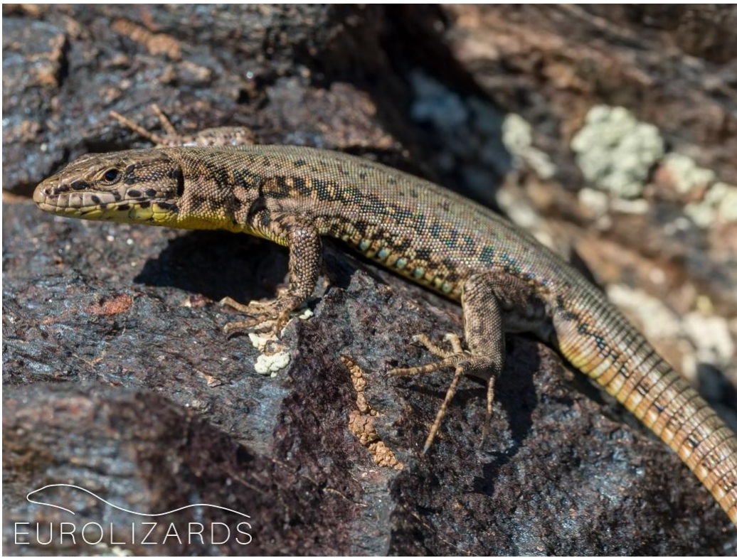
Male with yellow underside: E / Puerto de la Ragua (Granada), 28.10.2017.