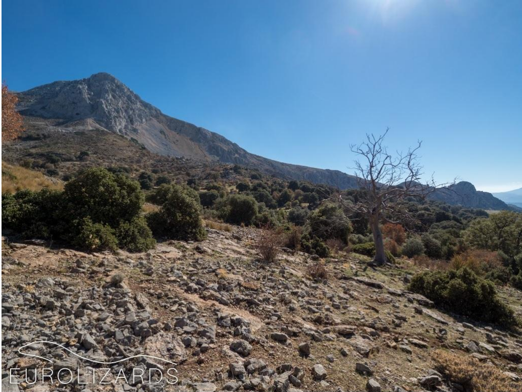
Sierra Mágina (Jaén): In this isolated mountain range, Podarcis vaucheri occurs at altitudes up to 2000 m.