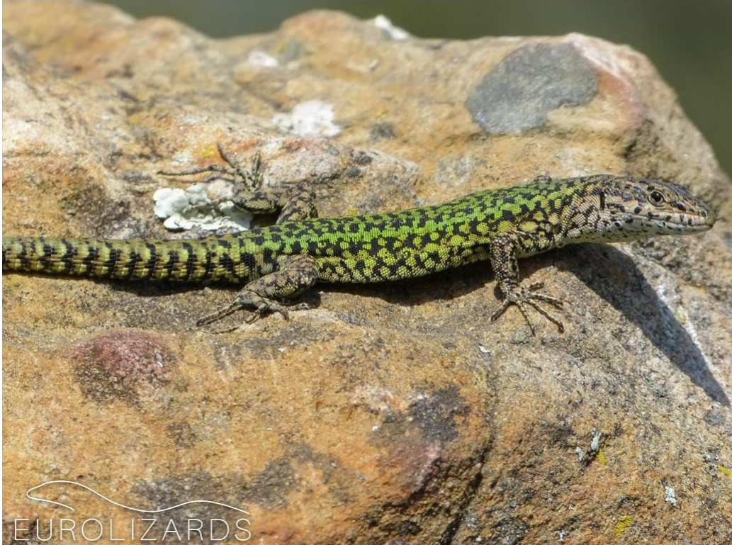
Male with green back: E / Los Alcornocales (Cádiz), 17.03.2012

Podarcis vaucheri is widespread in Northern Africa and Andalusia and frequently the only Wall Lizard in this area. Anyhow, sometimes it may be a confusing species: In literature, it is often described as a lizard with green backs and grey heads. This seems to apply only for some populations, indeed. But actually, this species is quite variable in pattern. In particular in eastern Andalusia there are populations with no green colours at all. These lizards just don't care what they are expected to be.