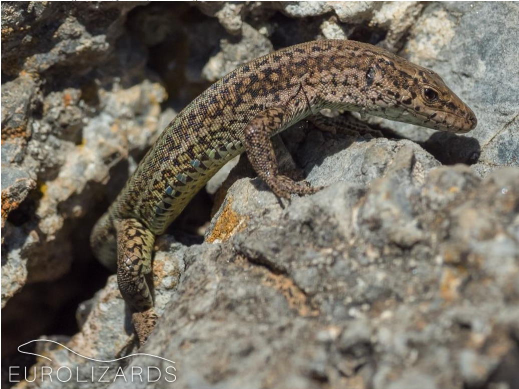
Male: E / Sierra Nevada Ski Center (Granada), 17.11.2016 - In Sierra Nevada, these lizards occur in altitudes over 2000 m.