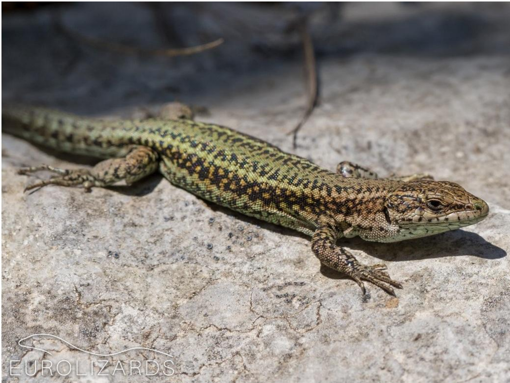
Male: E / Sierra Mágina (Jaén), 31.10.2017 - Note the greenish back and the dark flanks.