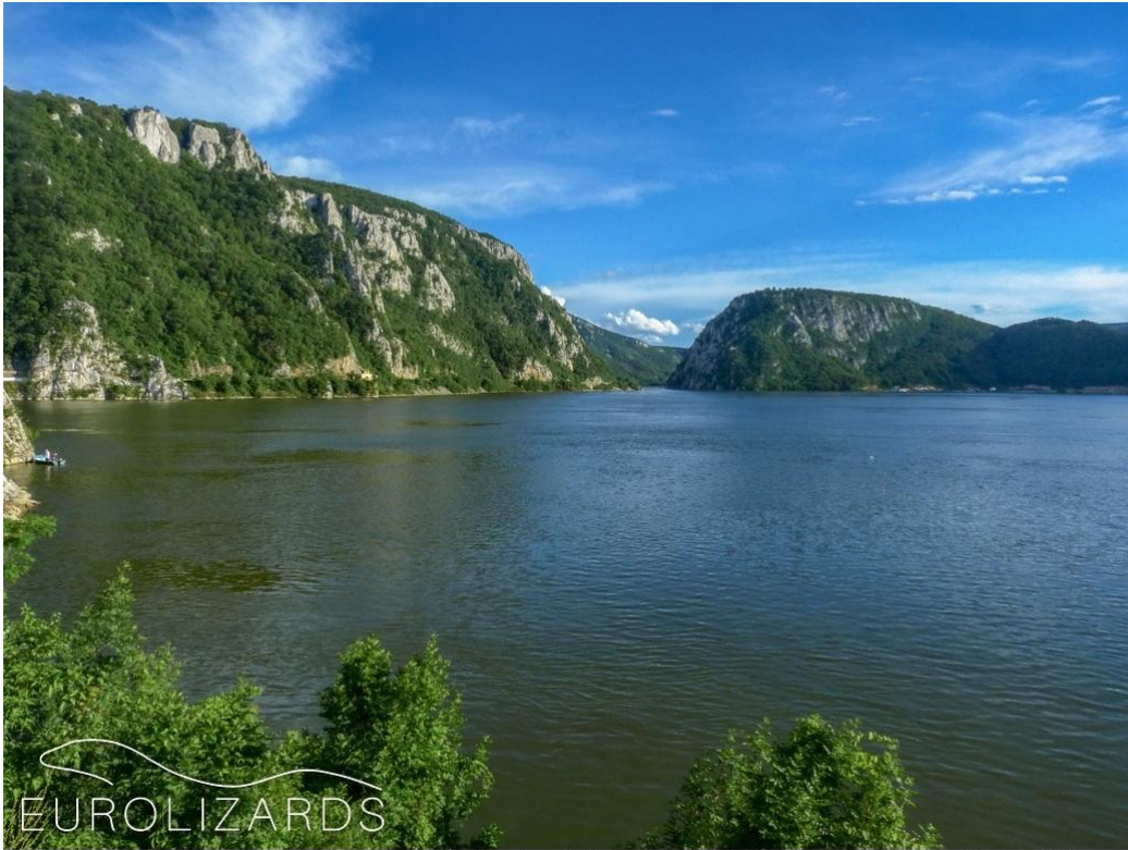
The forests along the Danube valley upstream of Dobreta Turnu Severin (Romania) are habitat for Darevskia praticola and Lacerta viridis .