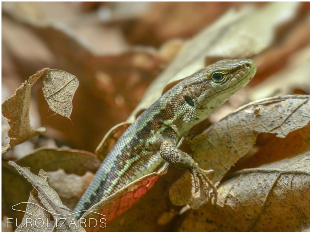
Male: RO / Mănăstirea Vodita (Orșova), 01.06.2013 - Darevskia praticola has whitish, unspotted throats.