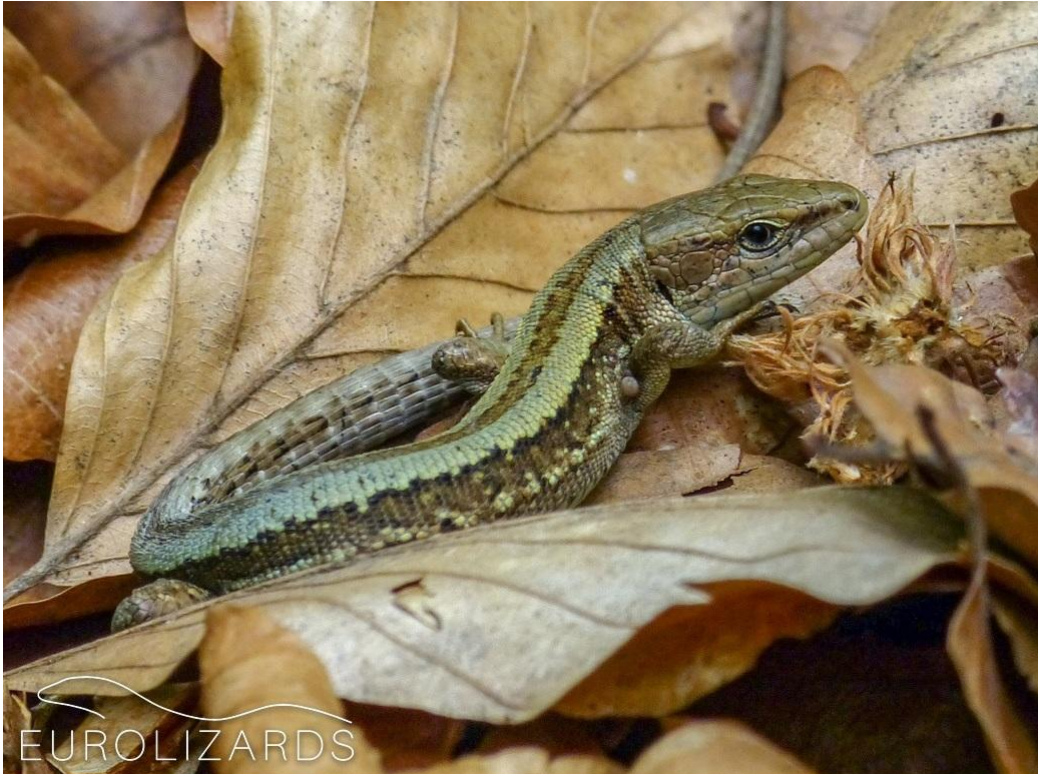
Male: RO / Eșelnița (Orșova), 01.06.2013 - Note the broad vertebral streak.