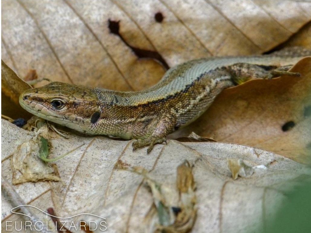
Male: RO / Eşelnița (Orsova), 01.06.2013 - These lizards often hide in litter.

Imagine a lizard so small that it can use a dry beech leaf as a deck chair - There you have Darevskia praticola ! Basically, the genus Darevskia comprises over 30 species, mainly in the Caucasus area, with Darevskia praticola subsp. pontica being its only representative in our area.