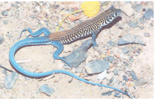
Nucras livida, juvenile-Farm Tierberg, NE of Prince Albert, WC

Conservation measures: None recommended.