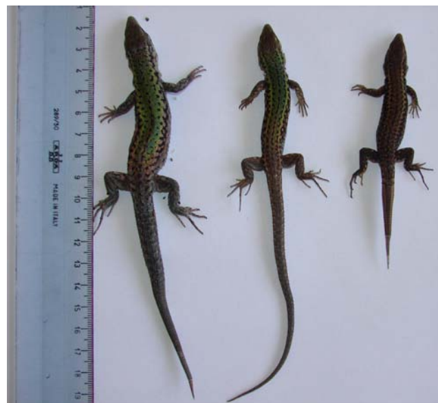
Fig. 1 Male lizards from Exo Diavates (left), Lakonissi (middle), and Skyros (right)

difference disappeared when Lakonissi and Exo Diavates were removed ( \chi^2=0.199 , df=2 , P=0.91 ). Similarly, there were no differences between field and laboratory autotomy rates for most populations (all \chi^2\leq 0.01 , P>0.05 ) with the exception of Lakonissi and Exo Diavates ( \chi^2=14.8 and \chi^2=12.9 , respectively, P<0.05 ) reflecting the presence of extremely strong drivers causing autotomy (Fig. 1).