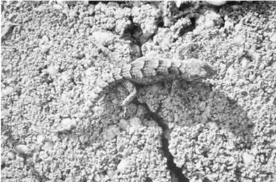
Plate 3. - Tenuidactylus kotschy . Folegrandos