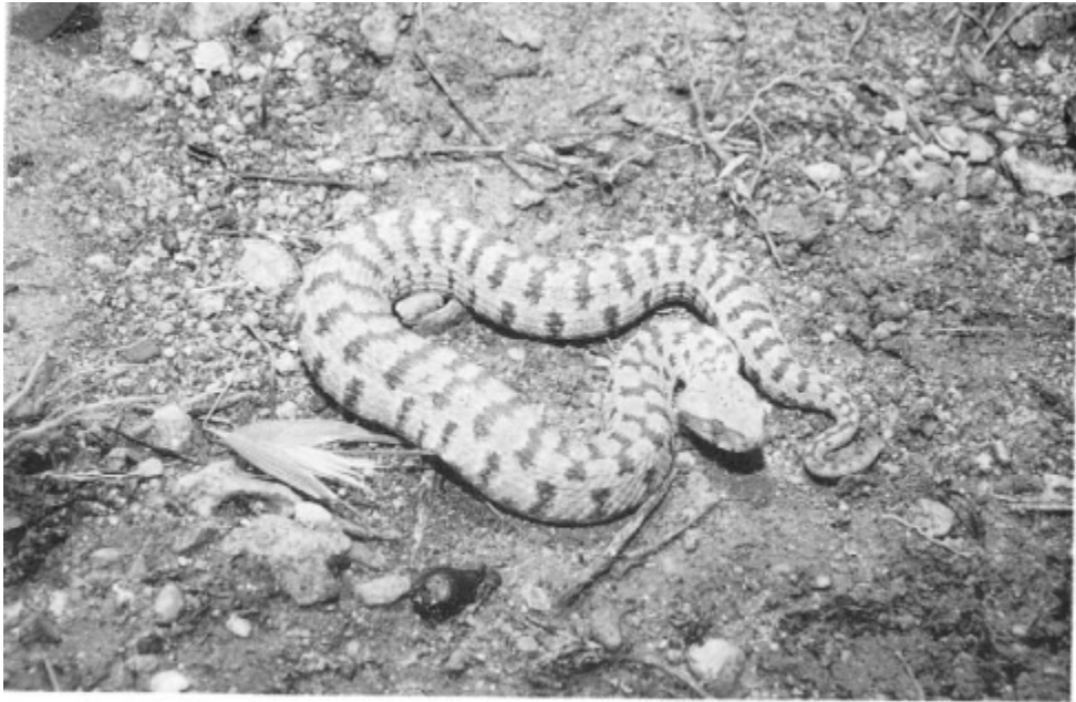
Plate 1. - Juvenile Vipera lebetina schweizeri . Milos