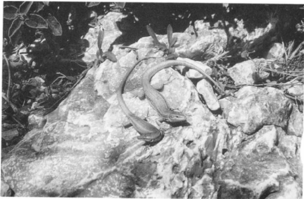
Plate 2. - Podarcis erhardii naxensis . Folegrandos