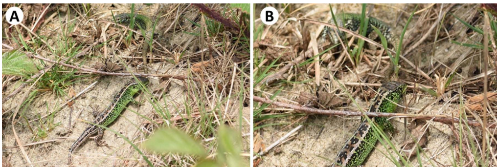
Figures 2A & B. Further interaction between the male L. agilis and P. muralis - A. The male L. agilis chases after the male P. muralis and grasps its tail, B. The male P. muralis turns to face the L. agilis