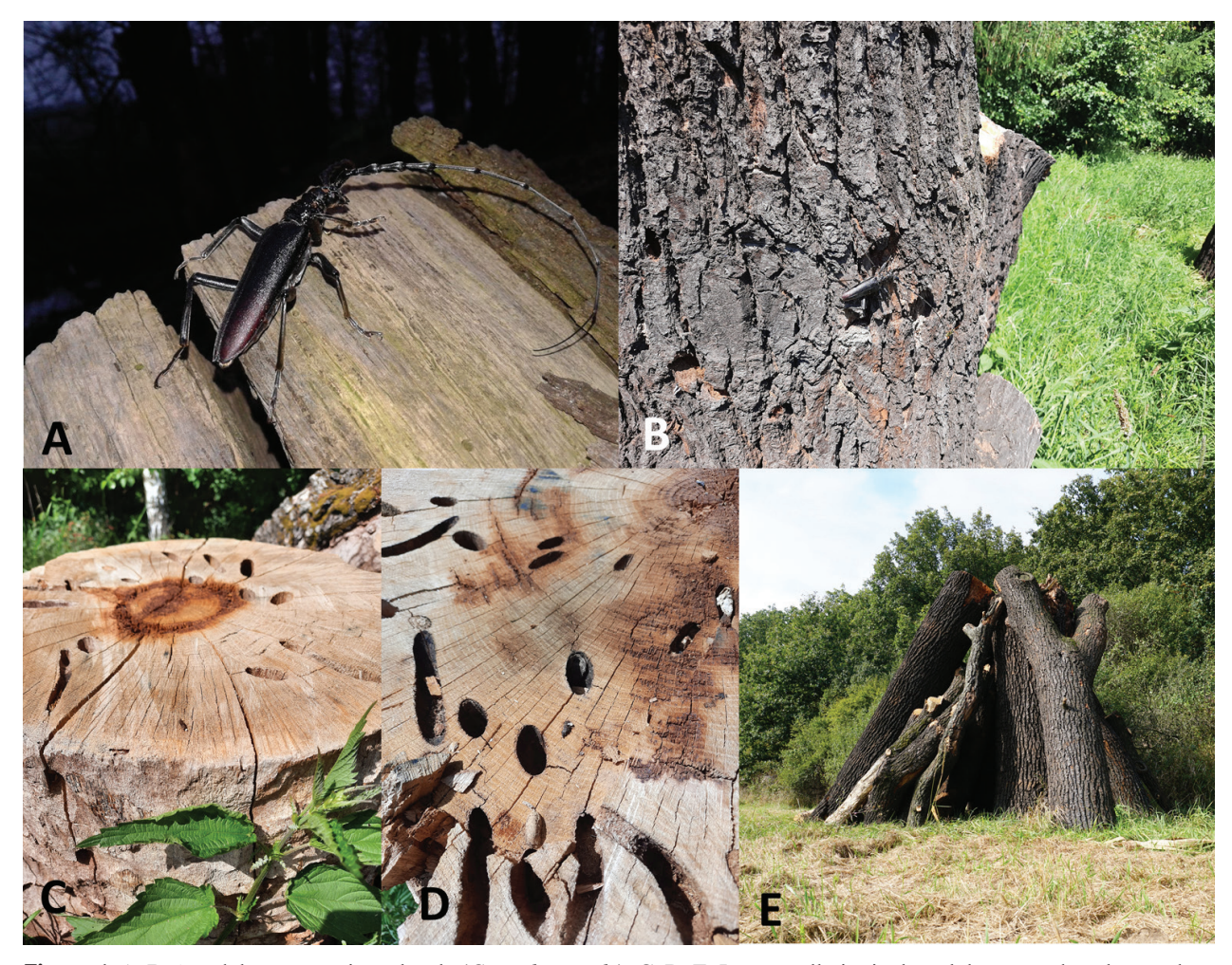
Figure 1. A, B. An adult great capricorn beetle ( Cerambyx cerdo ); C, D, E. Larvae galleries in the oak logs stored on the meadow.

Observations of lizards using the galleries at site 1 were conducted in May and June 2020 and March and April 2021. The observations were made independently during compensation action (RU) and other research and teaching field classes for biology students (BB, IG). The surveys were performed irregularly at different times of