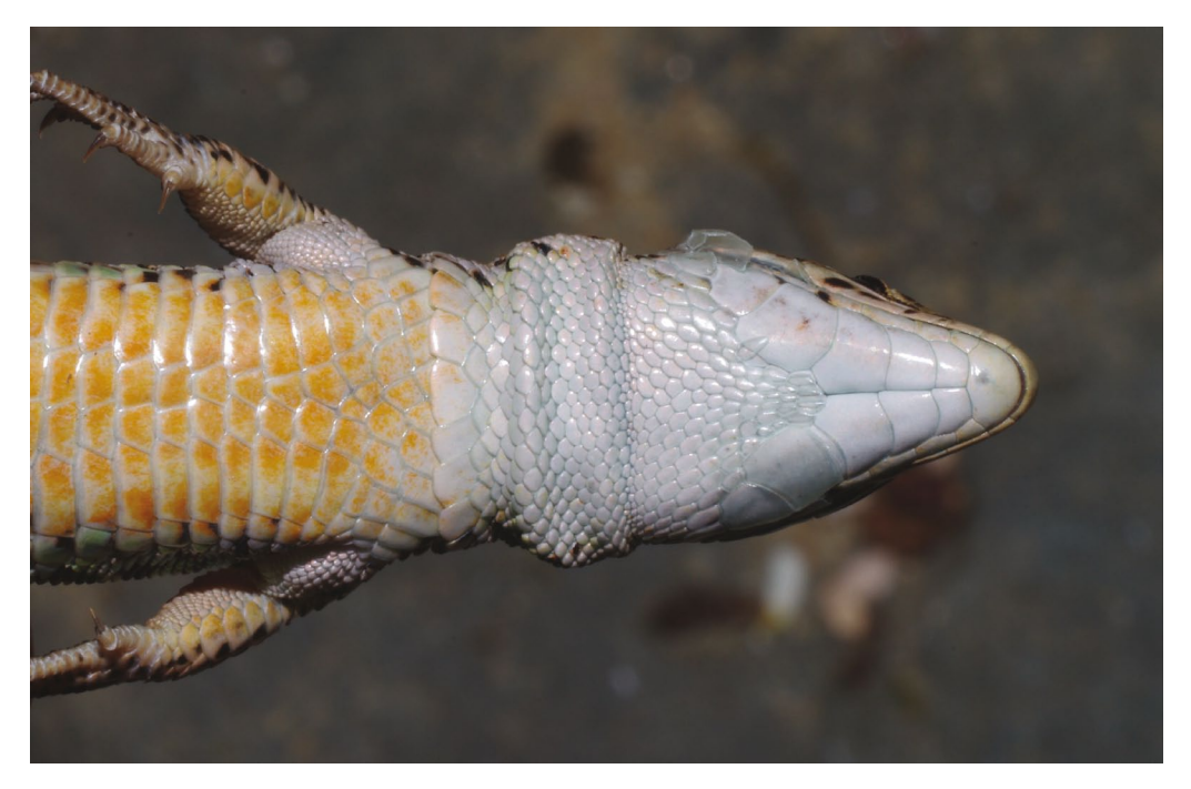
Fig. 12. Podarcis tauricus (Pallas, 1814) - adult male - ventral side of head, Váté písky NNM.

The co-existence of P. tauricus with abundant and significantly predominant Lacerta viridis is a special issue. This much bigger and stronger lizard represents for P. tauricus potential problem both, as a predator and a competitor as well, because it is known to feed occassionally on lizards (including conspecific ones) (Kabisch 1986) and to have overlapping food spectrum (Mollov et al. 2012). Nevertheless, P. tauricus is known to live syntopically with L. viridis in Hungary (e.g. Csekés 2010, 2011) and their co-existence is facilitated through some niche segregation by the choice of different vegetation elements of the habitat (Babocsay 1997). An age-dependent habitat shifting in Lacerta viridis was reported from sandy grassland habitats in Hungary by Babocsay (1997) when only young specimens are abundant at Podarcis tauricus sites and following year disappear and are replaced by new hatchlings. Nagy et al. (2012) reported that L. viridis is much more frequent on the non-grazed fields what can be explained by the different extents of cover and heights of the vegetation, and possibly, the interspecific competition. Mollov et al. (2012)