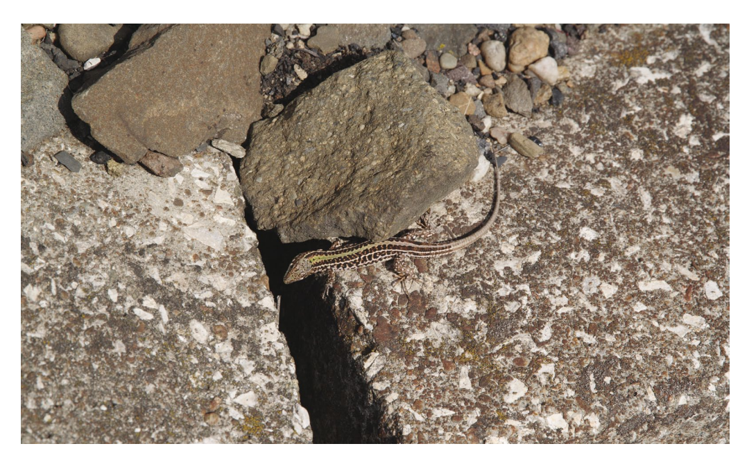
Fig. 7. Podarcis tauricus (Pallas, 1814) - adult male, Váté písky NNM, 17 July 2019.