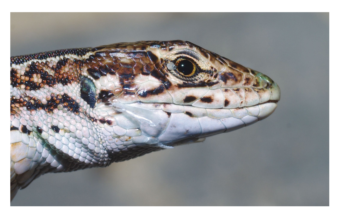
Fig. 11. Podarcis tauricus (Pallas, 1814) - adult male - lateral side of head, Váté písky NNM.