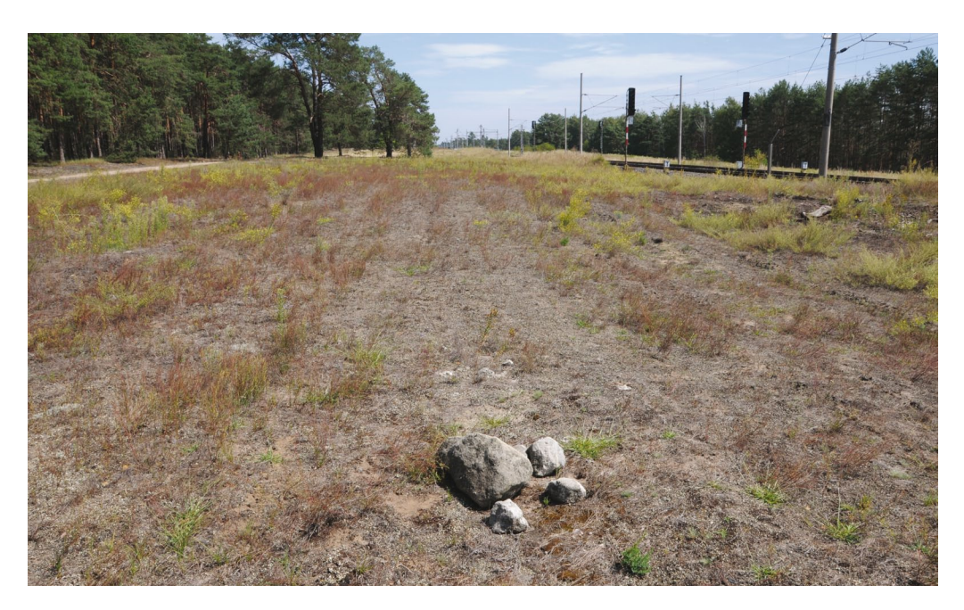
Fig. 5. Habitat of Podarcis tauricus (Pallas, 1814), Váté písky NNM, 10 August 2019.