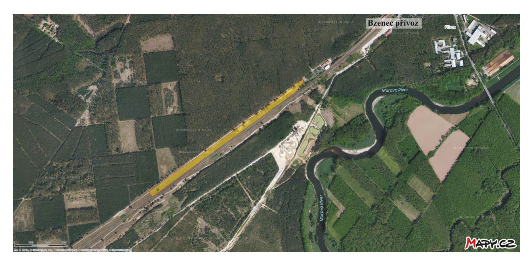
Fig. 2. Map indicating the area (yellow, in red frame) of the recorded occurrence of Podarcis tauricus (Pallas, 1814) at Váté písky NNM.

17 July 2019 . 09:00–17:00. Weather clear, sunny, calm. Air temperatures 20–26 °C. KB, DF a BM recorded three P. tauricus hatchlings (i.e. this year juveniles) in a sparse steppe vegetation on edge of rail causeway with a densier vegetation (at 10:00, 10:15 and 16:30). Moreover, the adult male with a regenerated tail was seen in a sparse steppe vegetation and collected when escaped on rail causeway. All specimens were in the same site as previous ones. Dozens of subadult and adult