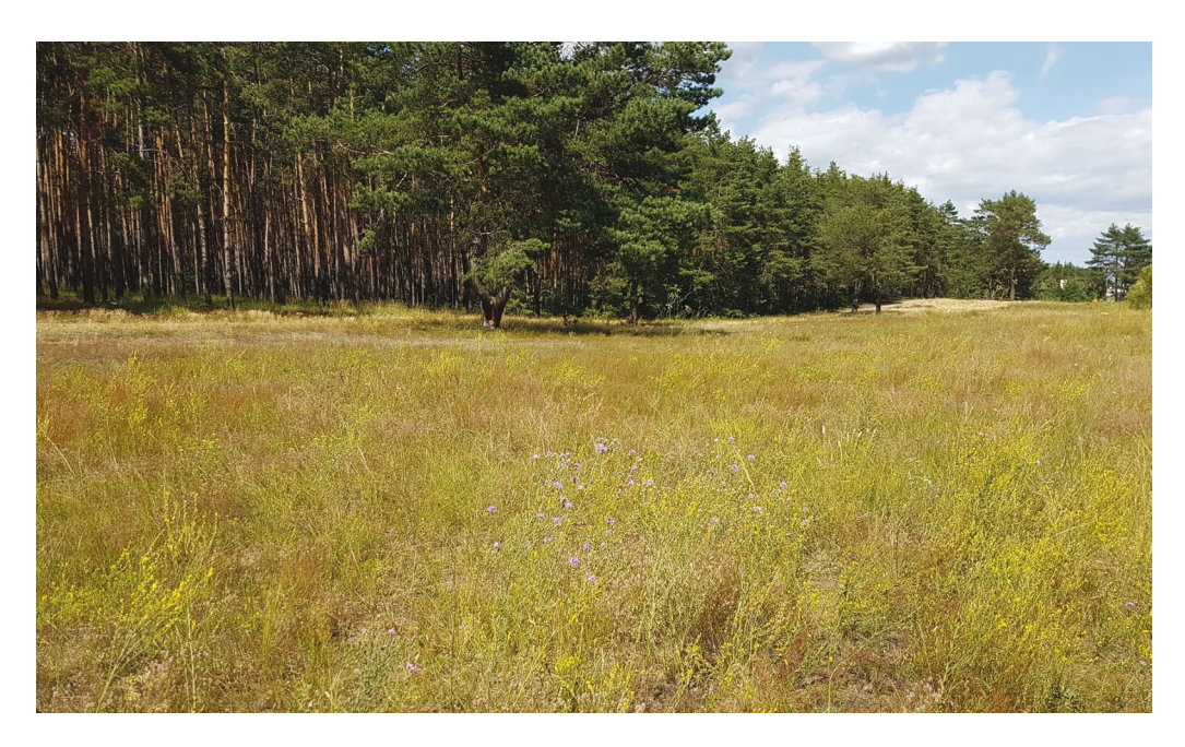
Fig. 3. Habitat of Podarcis tauricus (Pallas, 1814), Váté písky NNM, 11 July 2019.