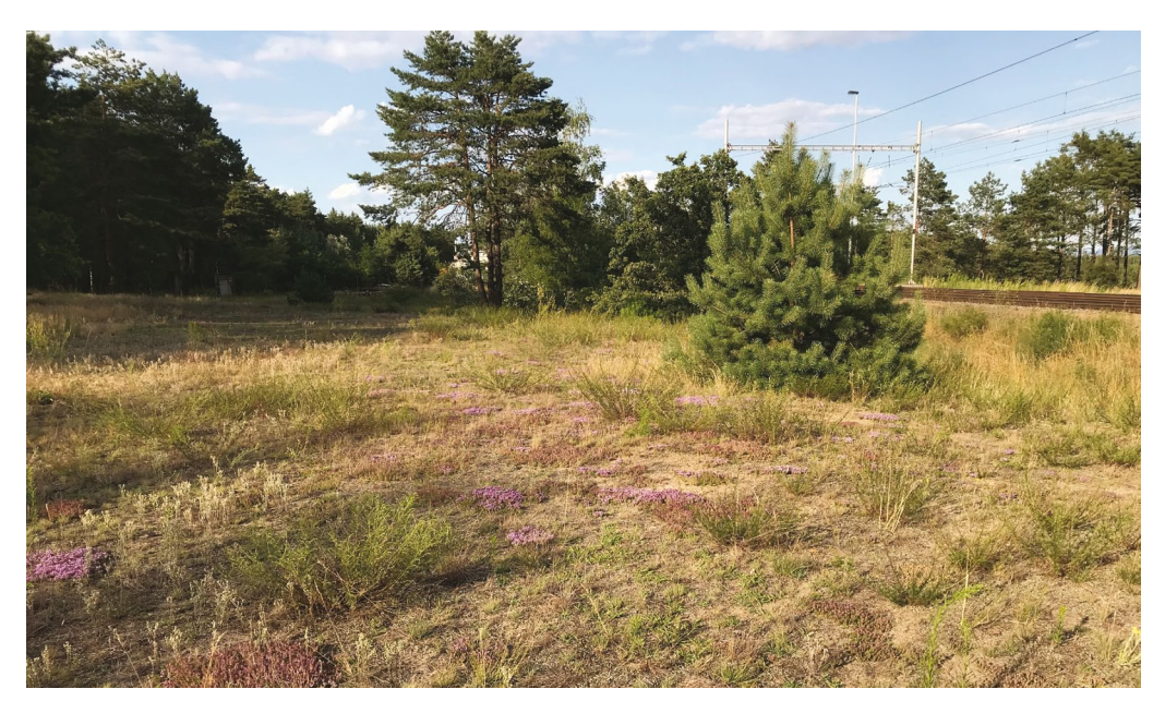
Fig. 4. Habitat of Podarcis tauricus (Pallas, 1814), Váté písky NNM, 11 July 2019.