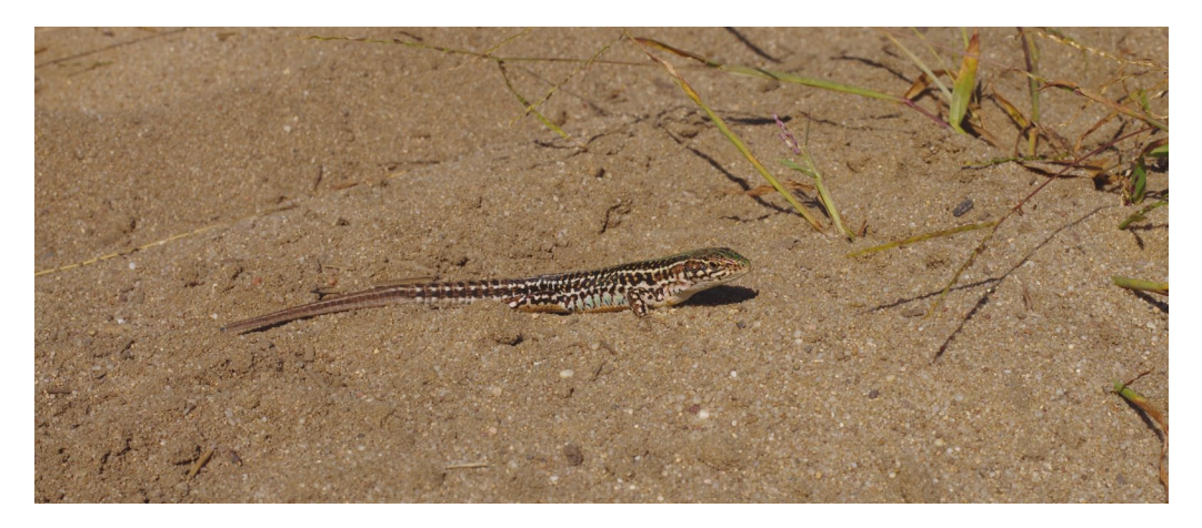
Fig. 9. Podarcis tauricus (Pallas, 1814) - adult male, Váté písky NNM, 5 September 2019.

An important factor is the management of vegetation coverage on the site. According to our observations, P. tauricus prefers sparsely overgrown places. However, this habitat with sparse vegetation is relatively short-lived. Without active management it ceases to exist by natural succession. In the last few years the succession in the Váté písky has been actively blocked by the pulling of turf (the last interventions were in 2017). A continuation of such management is necessary to preserve the type of vegetation and habitat preferred by P. tauricus and thus to ensure long term existence of the newly discovered population of P. tauricus . Nagy et al. (2012) reported a grazing as a positive factor to meet habitat requirements of P. tauricus .