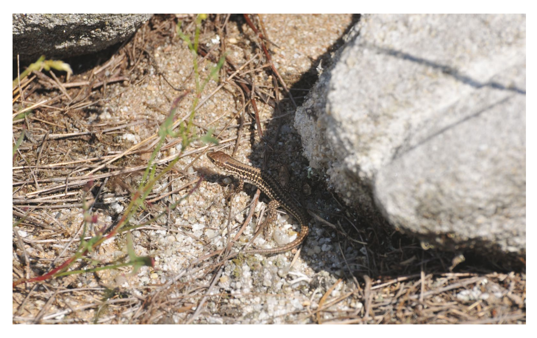
Fig. 8. Podarcis tauricus (Pallas, 1814) - hatchling, Váté písky NNM, 10 August 2019.