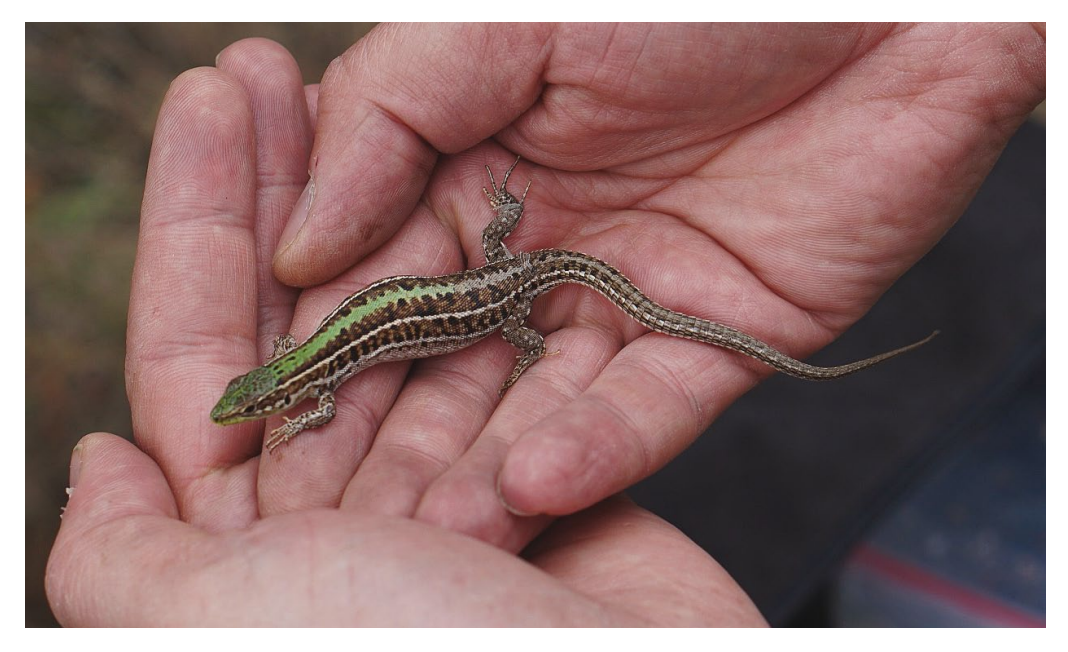
Fig. 6. Podarcis tauricus (Pallas, 1814) - gravid female, Váté písky NNM, 11 May 2019.