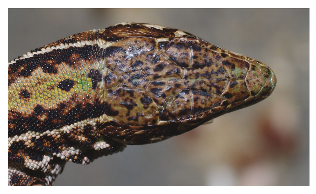
Fig. 10. Podarcis tauricus (Pallas, 1814) - adult male - dorsal side of head, Váté písky NNM.