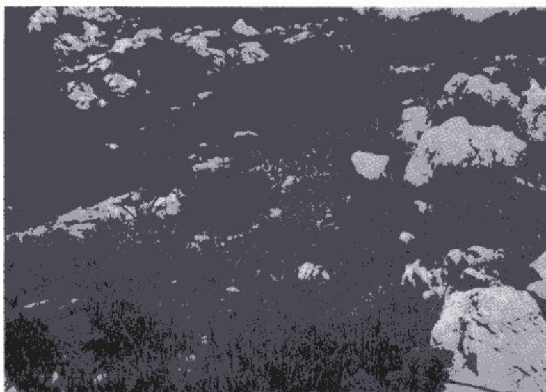
Plate 2. Small marshy area with trickling stream in Area 3. Natrix maura and Rana ridibunda were abundant. T. mauritanica was also to be found among the rocks.