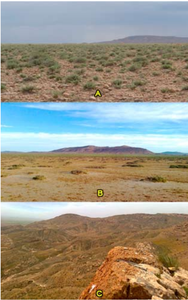
Figure 2. Study sites: Mergueb (A), L'mhazem (B), and Kaf Afoul (C).

a northern latitude of 35°54' and an eastern longitude of 03°34'. This mountain also constitutes the northern limits of the steppe areas, beyond which the massif of the Atlas Tellien begins.