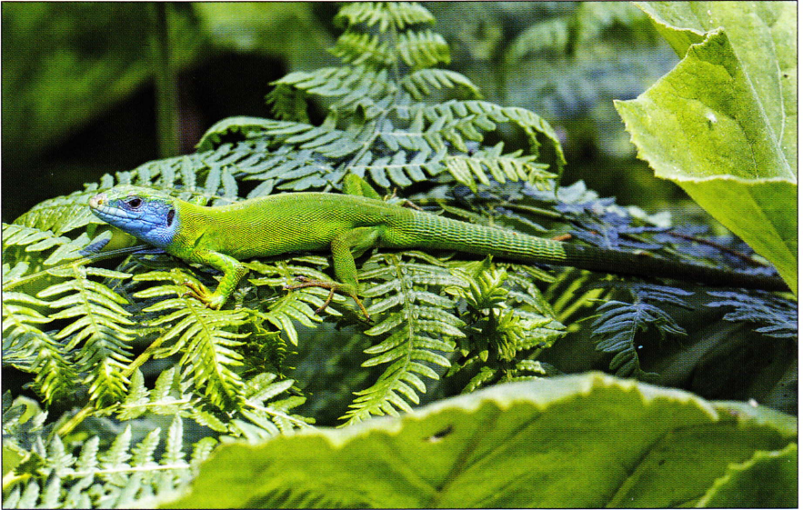
Fig. 226: Lacerta viridis is a slender and elegant lizard and a good climber usually seen resting in the vegetation rather than on the ground.