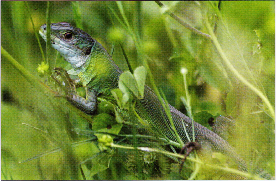
Fig. 229: Female Lacerta viridis .