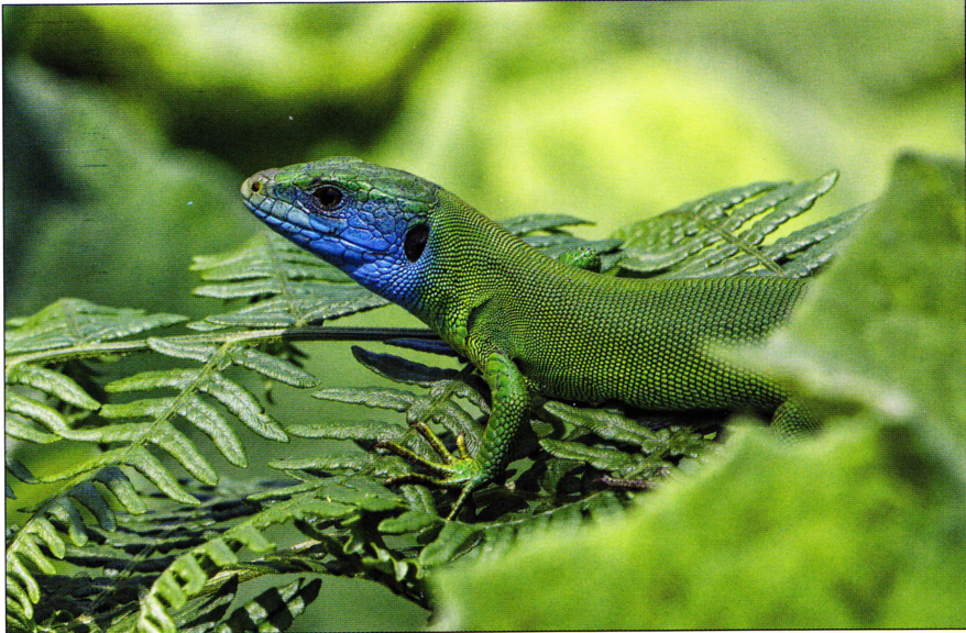
Fig. 225: Male Lacerta viridis with distinct blue chin, cheek and throat with no yellow shades and no dark vermiculate markings on the head typical of this species.

L. viridis is a slender, long tailed and very elegant lizard intermediate in size to the two other green lizards in the area, with a total size around 35 cm for adults and 8–9 cm for newly hatched juveniles. The tail is very long, making up 75% of the total length as compared to 65% in e.g. L. trilineata , and its body mass is only about 60% of a L. trilineata