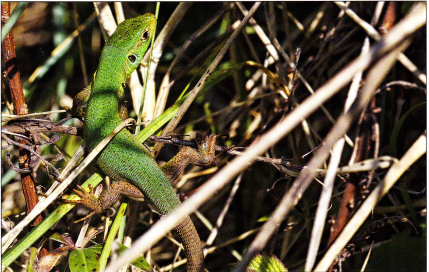
Fig. 227: Subadult Lacerta viridis could be mistaken for a green morph of Podarcis tauricus but these species differ in head scalation, habitat and behaviour.