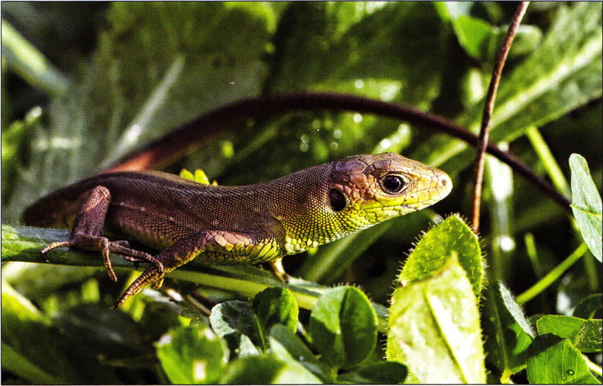
Fig. 228: Juvenile Lacerta viridis with only two faint lateral (dotted) and dorsal lines. In some specimens the lines are lost and the back marked with diffuse slightly darker irregular spots.

of comparable size. It has a uniform and deep green colour with little or no yellow, no dark vermiculate markings on the head scales and in males, and sometimes old females, the cheeks are distinctly blue. It has relatively long legs and is a good climber and can be seen resting in bushes and on top of brackens and other plants. Juveniles are light brown or olive coloured and normally have two rows of pale stripes on the back and one dotted line on each side, but both these markings can be very subtle or even missing.