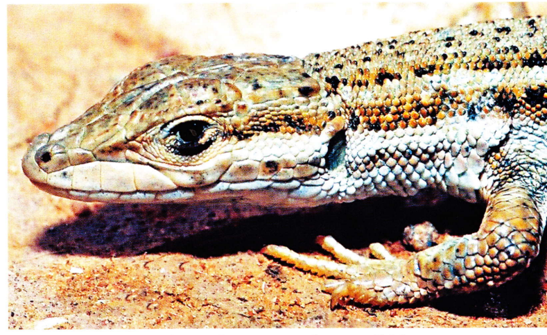
Fig. 512: Portrait of a male Mesalina simoni . 10 km past Chichaoua towards Marrakech.

Habitat: Arid, rocky plateaus with sparse vegetation.