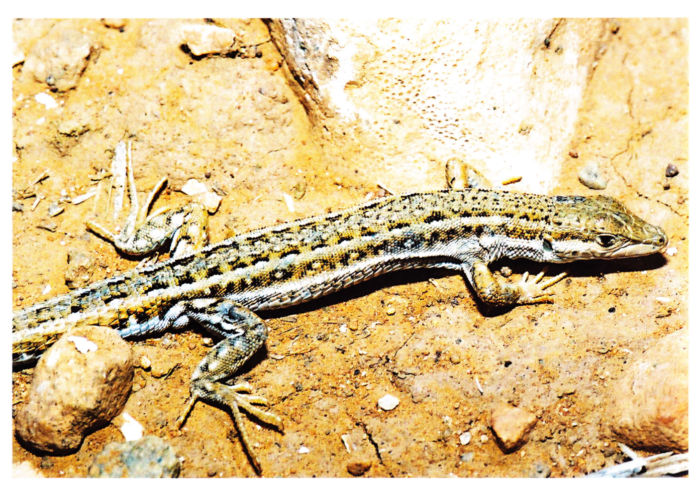
Fig. 513: Mesalina simoni, male. 10 km past Chichaoua towards Marrakech.