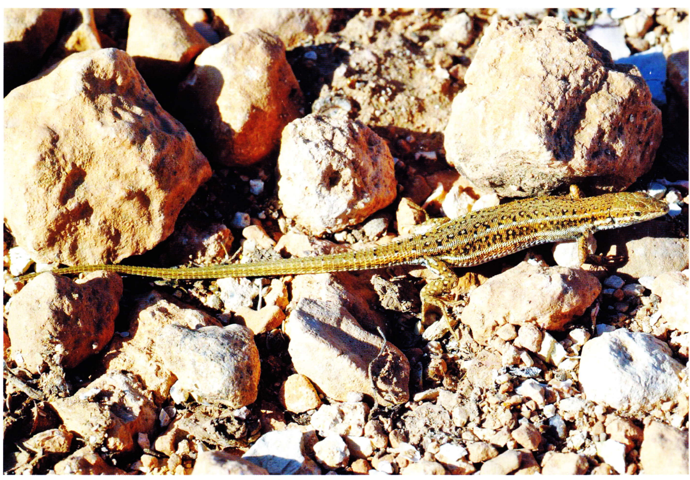
Fig. 514: Mesalina simoni, female. Between Marrakech and Essaouira.