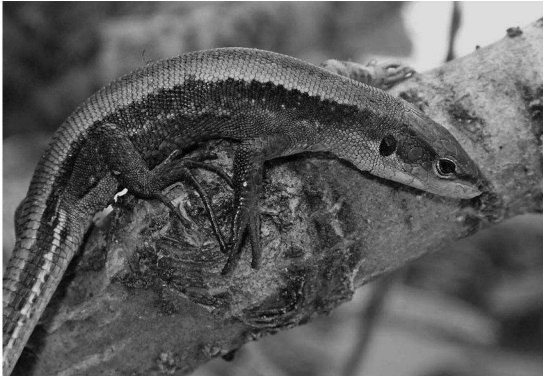
Fig. 1. Female Darevskia praticola from Vršački breg, Serbia.

Turkey and Greece (Arnold and Ovenden 2002). There it presents a patchy distribution connected to broad-leaved woodlands exposed to the influence of Submediterranean climate, restricted mainly to middle altitudes rarely exceeding 600 m (Stugren 1984).