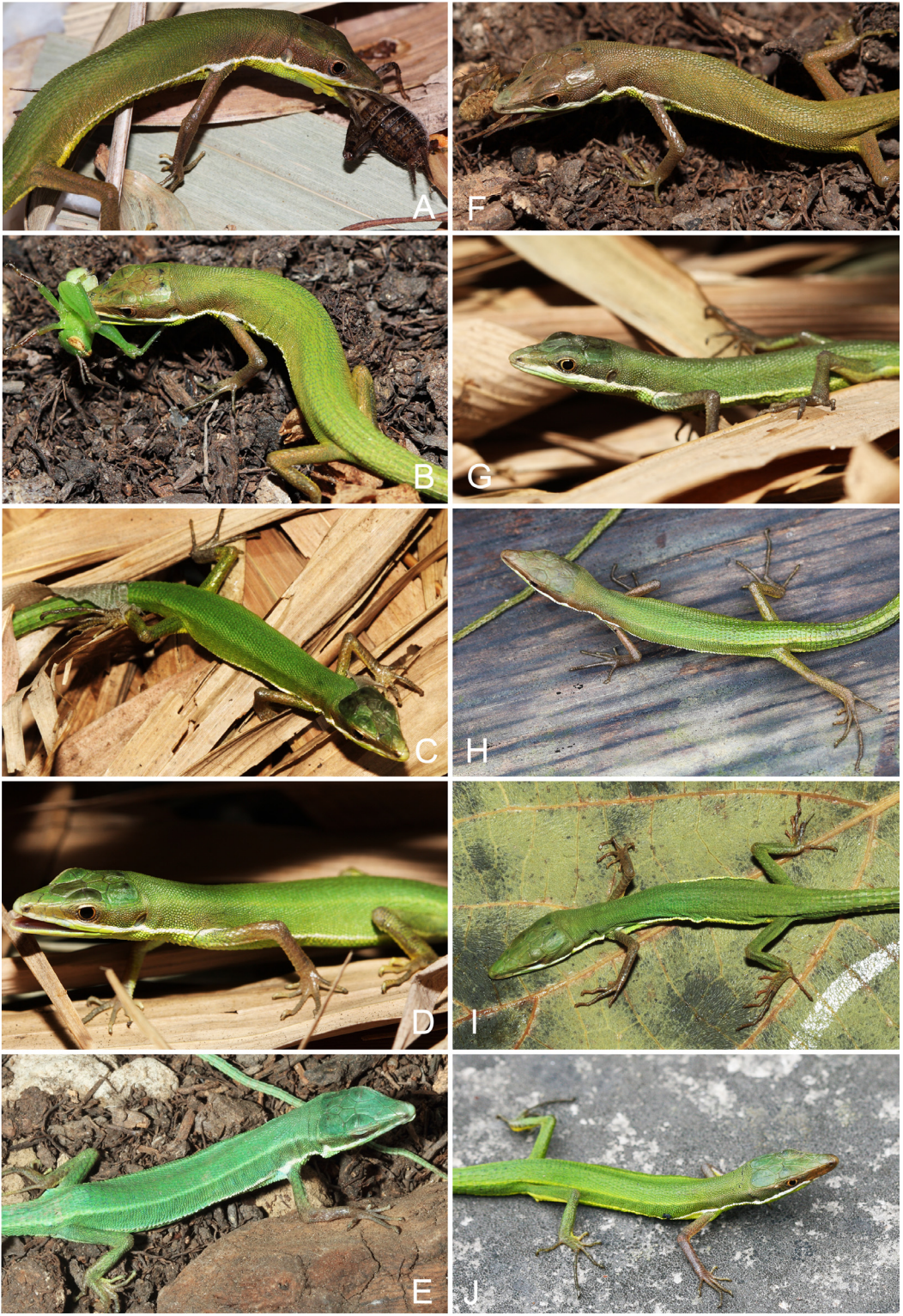
Figure 1. A-E: SYS r000207, female (A, photography on 13 October, 2008; B, on 05 November 2008; C, on 20 March 2009; D, on 12 April 2009; E, on 8 March, 2010); F-G: SYS r000184, female (F, photography on 05 November 2008; G, on 12 April 2009); H: SYS r000159, male; I: SYS r000205, male; J: SYS r000178, female.