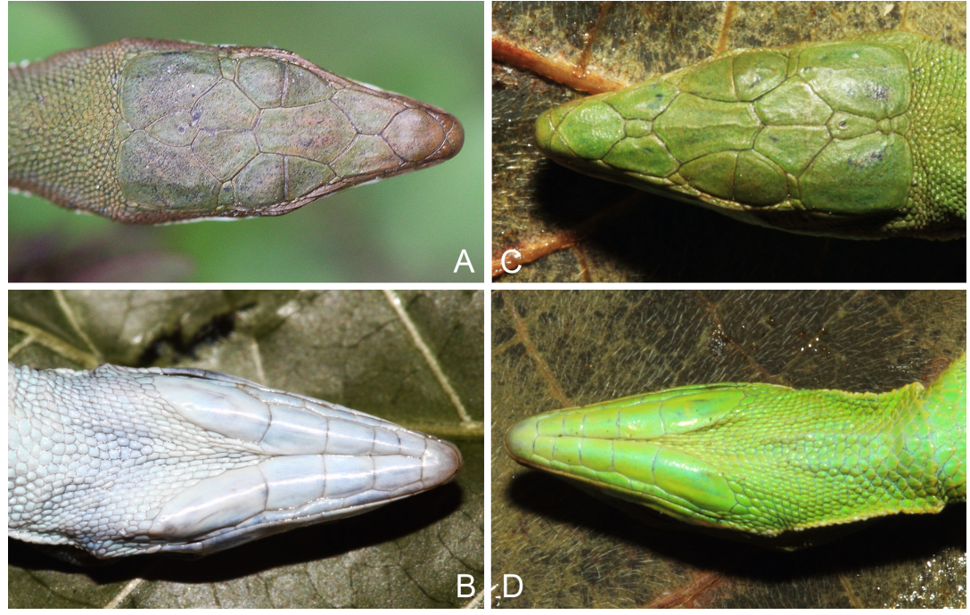
Figure 2. A: Dorsal view of head (SYS r000159), showing the parietals contacting each other behind interparietal; B: ventral view of head (SYS r000184), showing five chin shields on right side; C: dorsal view of head (SYS r000205), showing prefrontals contacting each other; D: ventral view of head (SYS r000205), showing five chin shields on both sides.

Pope (1929) did not mention the presence of tiny scales behind the parietals in type specimens. In our SYS r000159 and SYS r000148, the parietals contact each other behind the interparietal whereas the parietals of the other four specimens and Anhui's specimens (Tang et al., 2007) were separated by 1-3 scales behind