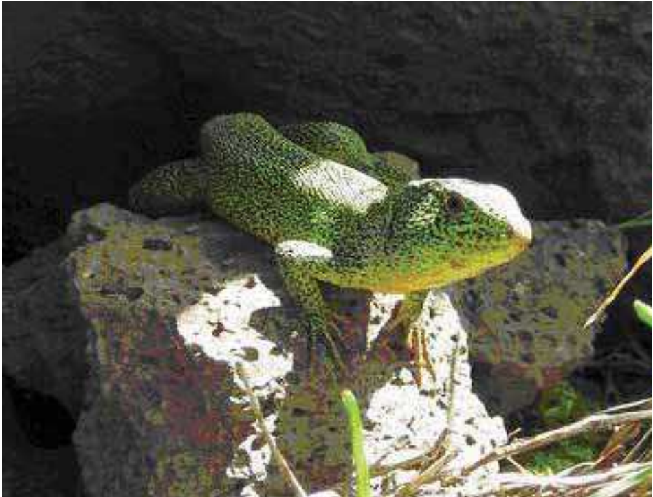
Fig. 1. Adult male of Lacerta media israelica basking next to the wall of a fruit plantation.

Mediterranean climate. It is characterized by warm, dry summers and cold, wet winters with a mean maximum temperature of 29°C and mean minimum temperature of 4°C. Its mean annual precipitation of 1000 mm is the highest in Israel (YOM-TOV & TCHERNOV 1988).