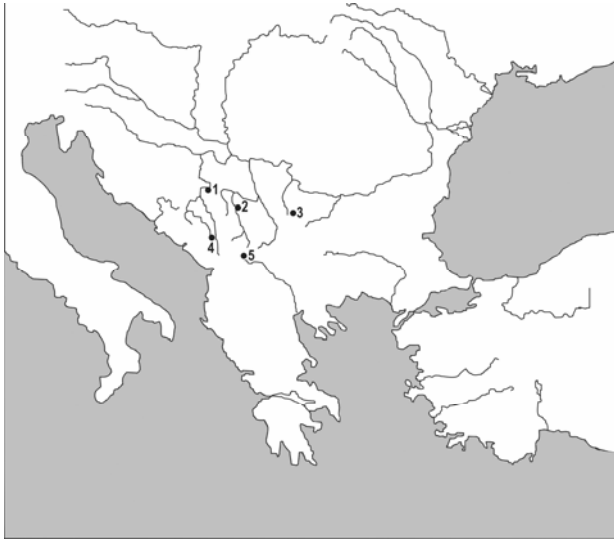
Figure 1. Location of Zootoca vivipara populations used in this study. 1-Tara Mt. (Serbia); 2- Mt. Kopaonik (Serbia); 3- Mt. Stara (Serbia); 4- Mt. Bjelasica (Montenegro); 5- Mt. Šara (Serbia).

sea level, 43° 54'N, 19° 22'E; 0 females, 3 males); 2 – Mt.Kopaonik, Serbia (Pančićev vrh, 2000m, 43° 16'N, 20° 49'E, Mali Karaman, 1904 m, 43° 17'N, 20° 50'E, Mala Gobelja, 1800m, 43° 19'N, 20° 49'E, Velika Gobelja, 1870m, 43° 18'N, 20° 49'E; 9 females, 5 males); 3 – Mt. Stara, Serbia (Stražna čuka, 1740m, 43° 16'N, 22° 48'E, Kopren: Šošina vunija, 1840m, 43° 17'N, 22° 48'E, Ponor, 1434m, 43° 15'N, 22° 48'E; 13 females, 7 males); 4 – Mt. Bjelasica, Montenegro (Pešića jezero, 1840m, 42° 51'N, 19° 41'E; 3 females, 0 males); 5. Mt. Šara, Serbia (Piribeg: Crvena karpa, 42° 10'N, 21° 02'E, 1800-1900m, Štrbački jalovarnik, 42° 11'N, 21° 02'E, 1700m and Čemeriste, 2050-2100m, 41° 54'N, 20° 42'E; 32 females, 24 males).