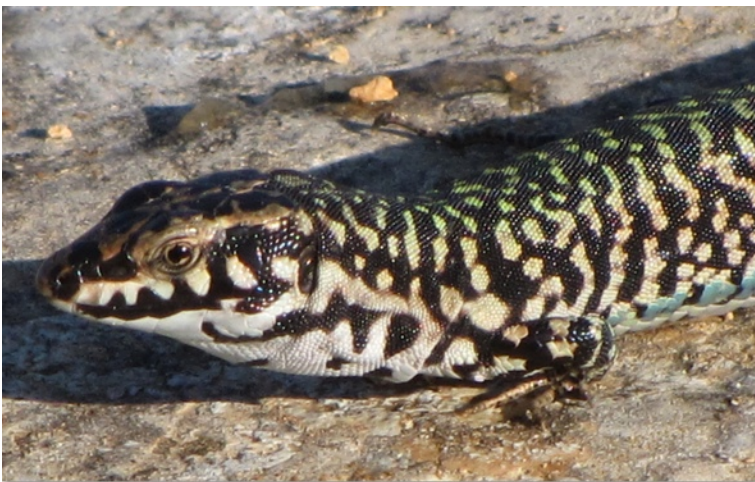
Figure 12: Male Podarcis filfolensis from Cominotto.