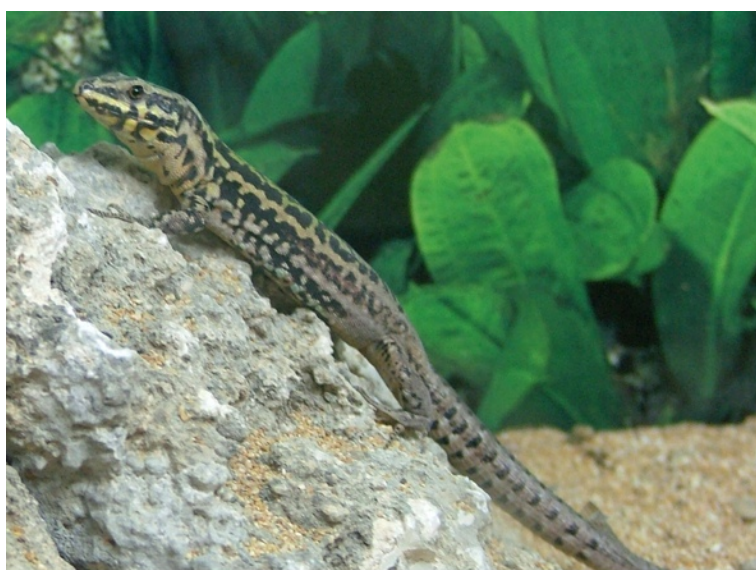
Figure 16: Male Podarcis filfolensis from Halfa rock.