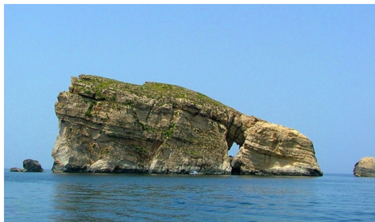
Figure 19: Fungus rock (General's rock), home of the threatened population of Podarcis filfolensis generalensis .

Fungus rock and Qawra islet are also under the invasion of rats, and if left unchecked, the generalensis lizards might end up the same. Other islets do not seem to have a rat problem yet, but they are very vulnerable just the same (SCIBERRAS & LALOV 2007 ; SCIBERRAS 2007a ; SCIBERRAS 2007b).