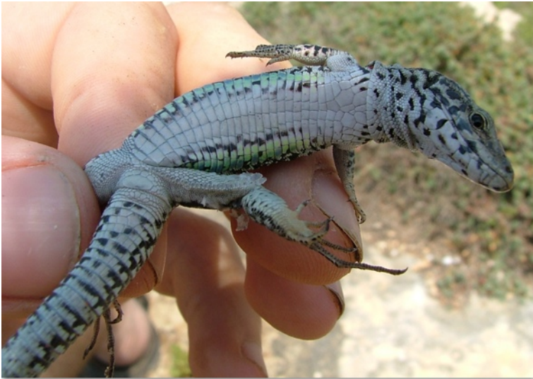
Figure 7: Male Podarcis filfolensis from Large Blue Lagoon rock.