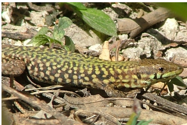
Figure 5: Male Podarcis filfolensis maltensis from Malta.

mainland, the phenomenon of urbanisation has also influenced the lizards, and like modern humans, or Maltese in this case, most are living in towns and villages, and their gardens. Apparently these days villages and towns offer more resources to both lizards and humans alike. While humans find commodity in shops, lizards find food in the form of domestic pests or organic refuse from our skips. With respect to safety, lizards in urban areas feel protected due to the lack of natural predators in urban areas. Lizards never venture far from their territory, and when danger lurks by, such as a cat or dog, the lizards quickly learn to run into the crevices of walls. The constant presence of humans, domestic animals and urban vermin, particularly rodents, make the urban lizards very wary, and thus hardly approachable. In natural habitats on the mainland, the Maltese Wall Lizard occurs mainly in coastal shores along urban areas, and they seem more or less wary compared to their urban counterparts (SCIBERRAS 2007a ; SCIBERRAS 2007b ; SCIBERRAS 2008). Their diet might be slightly varied, a mix of coastal bugs and food leftovers of human leisure activities.