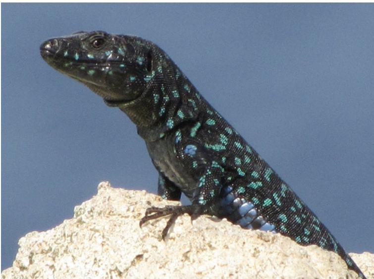
Figure 3: Male Podarcis filfolensis filfolensis from Filfola.

On Linosa, where the endemic population laurentimulleri , which is perhaps the most numerous population of this species, occurs in various altitudes, from the gently inclined coastline, to the steep volcanic hilltops. The altitudes also have varies vegetative communities, coastal garrigue to hill top maquis. The latter laurentimulleri , also occur on Lampione, where it seems less abundant but still in good numbers, do not have such options, as their ecosystem is only uniform, typical to islets. However the latter population is morphologically different from that of Linosa and the recently introduced population of Lampedusa.