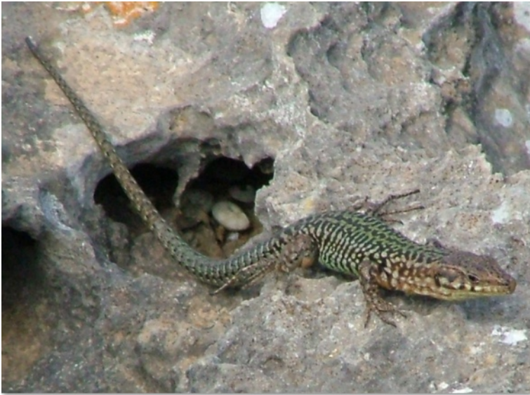
Figure 17: Male Podarcis filifolensis kieselbachi from Selmunett.

Skink, Chalcides ocellatus , which also occur in Malta. The Ocellated Skink co-exists happily with the lizards, they share the same habitats on both Lampione and Linosa, and don't mind one another, often observed side by side. The situation is totally different in the Maltese islands, they don't seem to live near one another here. On the mainland of Malta, Gozo and Comino, most of the natural habitats are skink territory, where lizards certainly are absent. In urban or hectic coastal areas, they might co-exist, but do not often share territories. One reason for this phenomenon may be the fact that the subspecies of skink on the Pelagian islands is different from that of Malta. The Pelagian ones are smaller than those of Malta,