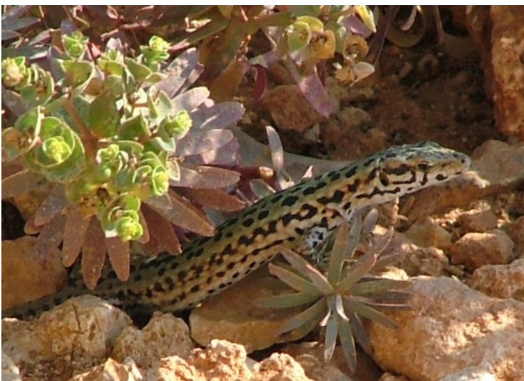
Figure 13: Female Podarcis filfolensis maltensis from Comino.

the presence of dense populations of Sea-gulls, the vegetation consist of a degraded coastal weedy community, which doesn't seem to effect the lizards, at least directly. Both populations of lizards are in good numbers and rely on the Sea-birds for food, such as from dead chicks and juveniles, and hatched or rotten eggs. Living with Sea-gulls is no easy task, as Sea-gulls are predatory birds and can easily turn lizards into their prey, but experienced lizards are fast enough to escape such potential threat. Human approach on the islet is also very rare on Lampione. This is where the similarity ends. Lampione's lizards are not very approachable, but are not as shy as those of the offshore islets of Malta, so they are adequately observable. Immediate behavior can be easily spotted. Fighting for a mating or territory is one of them. Lampione's female lizards have been seen fighting ferociously between each other for individual males, when it's usually the other way round. Fighting observed on Filfola was of territorial purpose, where adult males chase off unwanted juveniles and females out of their territory. Such observations were done in different seasons and thus not so comparable. Occasions to visit such islets have been