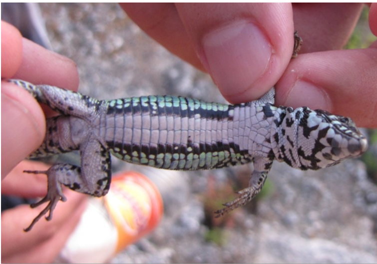
Figure 7: Male Podarcis filfolensis from Pigeon rock.