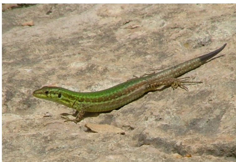
Figure 15: Female Podarcis filfolensis maltensis from Gozo.