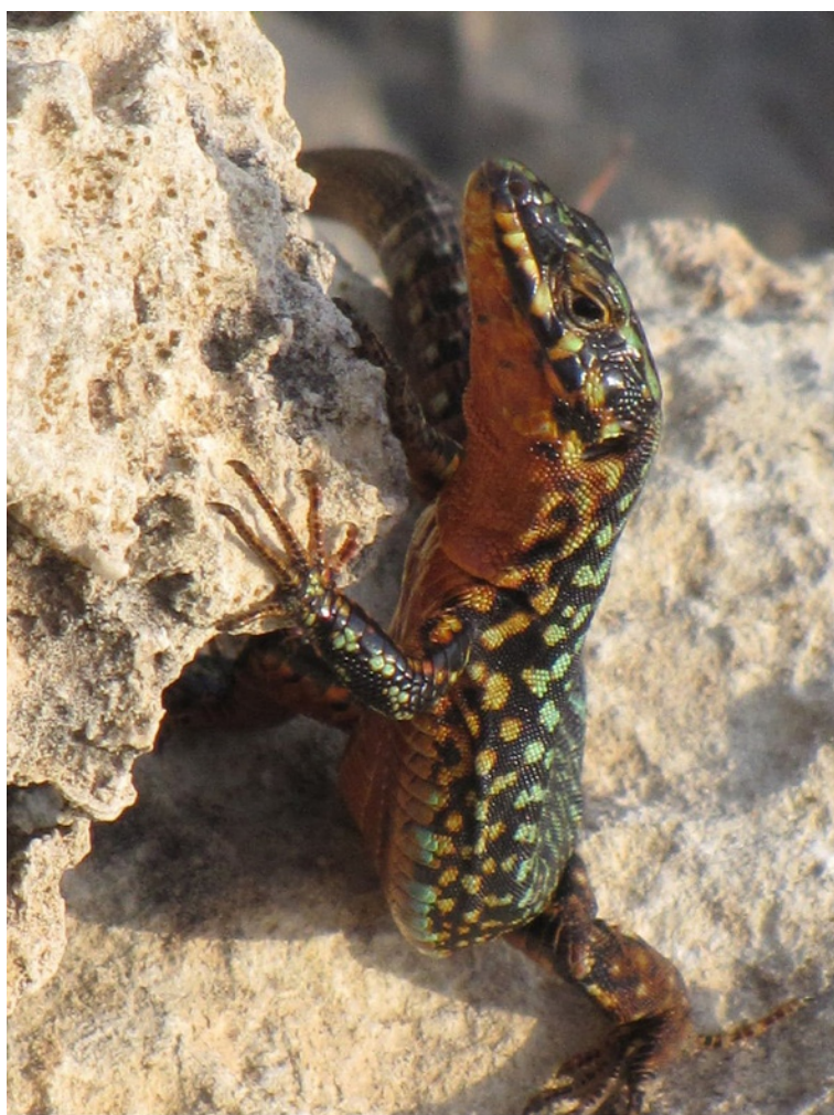
Figure 9: Male Podarcis filifolensis generalensis from Fungus rock.

The analogical biospheric evolution of Filfola and Lampione are amazingly very similar. With