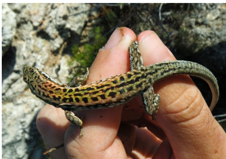
Figure 6: Female Podarcis filfolensis from Small Blue Lagoon rock.