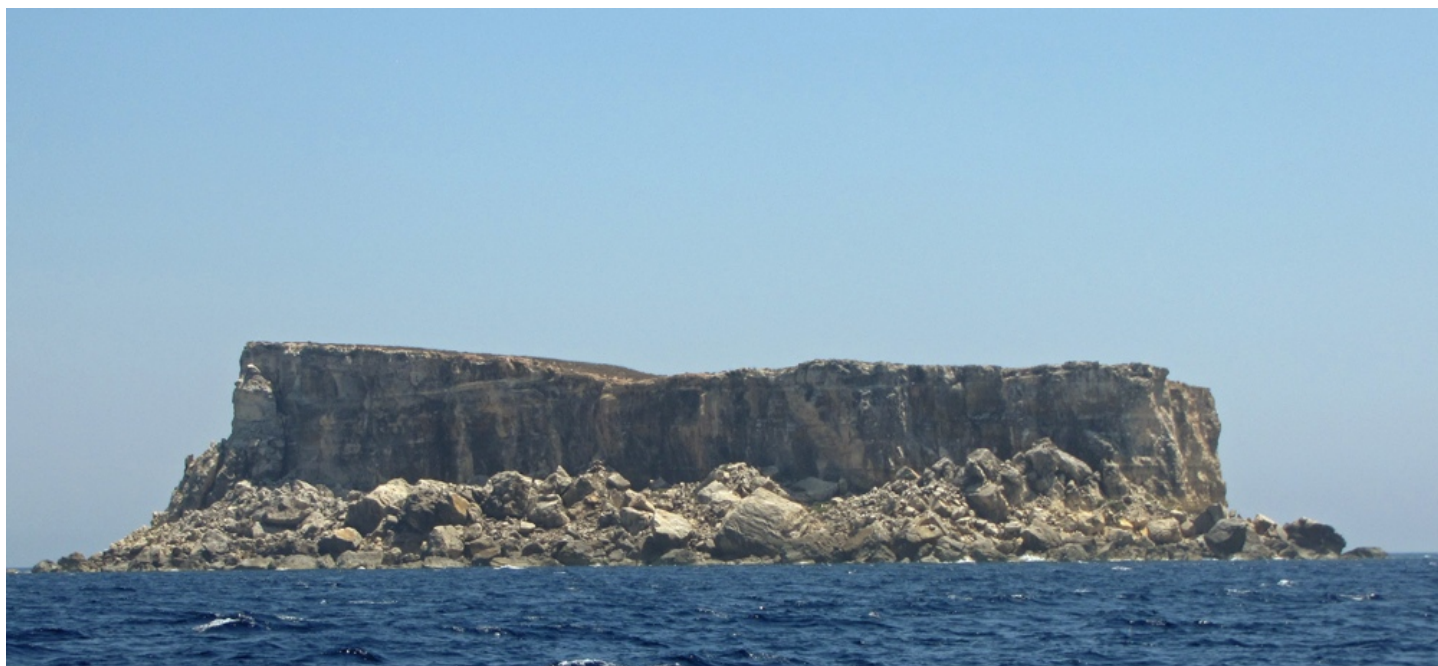
Figure 4: Filfola island, terra typica of Podarcis filfolensis , approximal 4 km to the south of Malta.

mainland, the phenomenon of urbanisation has also influenced the lizards, and like modern humans, or Maltese in this case, most are living in towns and villages, and their gardens. Apparently these days villages and towns offer more resources to both lizards and humans alike. While humans find commodity in shops, lizards find food in the form of domestic pests or organic refuse from our skips. With respect to safety, lizards in urban areas feel protected due to the lack of natural predators in urban areas. Lizards never venture far from their territory, and when danger lurks by, such as a cat or dog, the lizards quickly learn to run into the crevices of walls. The constant presence of humans, domestic animals and urban vermin, particularly rodents, make the urban lizards very wary, and thus hardly approachable. In natural habitats on the mainland, the Maltese Wall Lizard occurs mainly in coastal shores along urban areas, and they seem more or less wary compared to their urban counterparts (SCIBERRAS 2007a ; SCIBERRAS 2007b ; SCIBERRAS 2008). Their diet might be slightly varied, a mix of coastal bugs and food leftovers of human leisure activities.