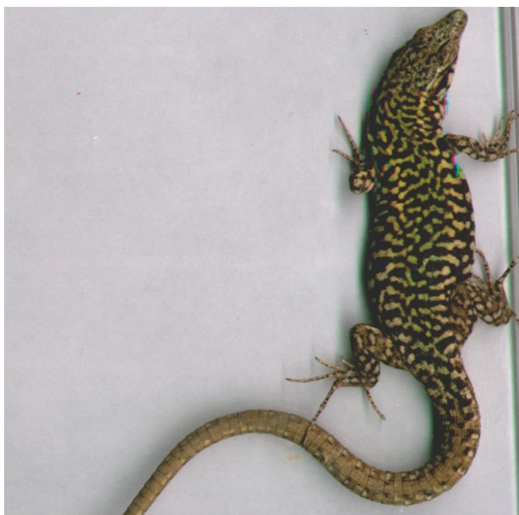
Figure 10: Male Podarcis filifolensis from Tac-Cawl rock.