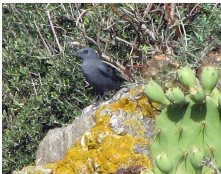
Figure 14: Blue Rock Thrush, Monticola solitaries .

What makes laurentimulleri unique from the lizards of Malta, apart from their morphological appearance, is their relationship with other reptiles, particularly the Ocellated