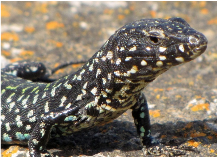
Figure 2: Male Podarcis filfolensis laurentimulleri from Linosa.

Hanging around the Maltese Wall lizard for so long brings up light on some interesting facts of their behavior. To start with, the Maltese Islands have only one species of wild lacertid lizard, the Maltese Wall Lizard, Podarcis filfolensis , with a number of populations living on islands and islets (SCIBERRAS 2004 ; SCIBERRAS 2005b ; SCIBERRAS 2010). Even outside Malta, though close by, on the Sicilian islands of Linosa, Lampedusa and Lampione, part of the Pelagian archipelago, this species exist as the only representative of these type of lizards. There this species is totally allopatric, isolated from similar species. The point is that there is no direct competition from a similar species, thus totally occupying its own niche within the ecosystem. However, even on such small islands, the ecosystem varies.