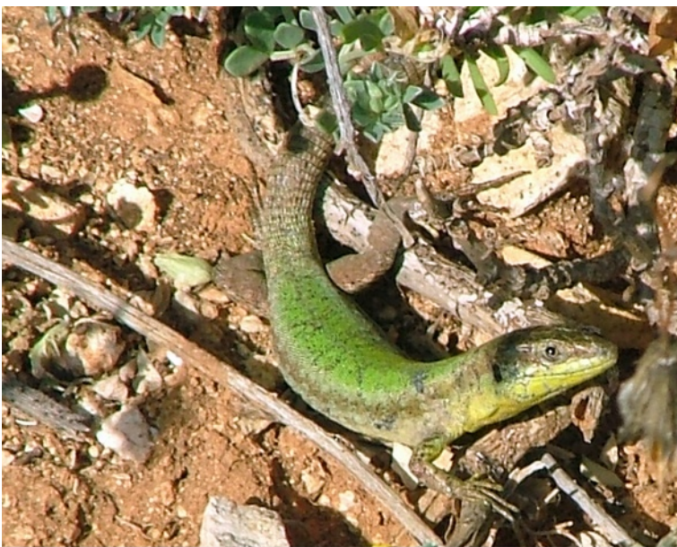
Figure 8: Male Podarcis filfolensis from Ta`Fraben island.