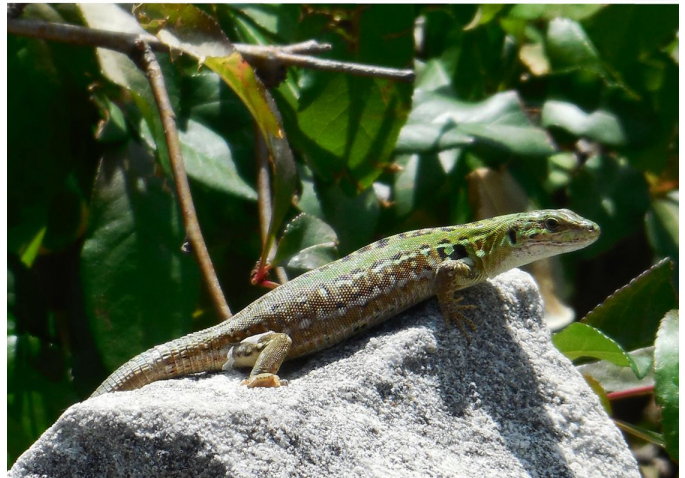
Fig. 1. Northern Italian Wall Lizards ( Podarcis siculus campestris ) in Joplin, Missouri: Adult male (top) and adult female (bottom).