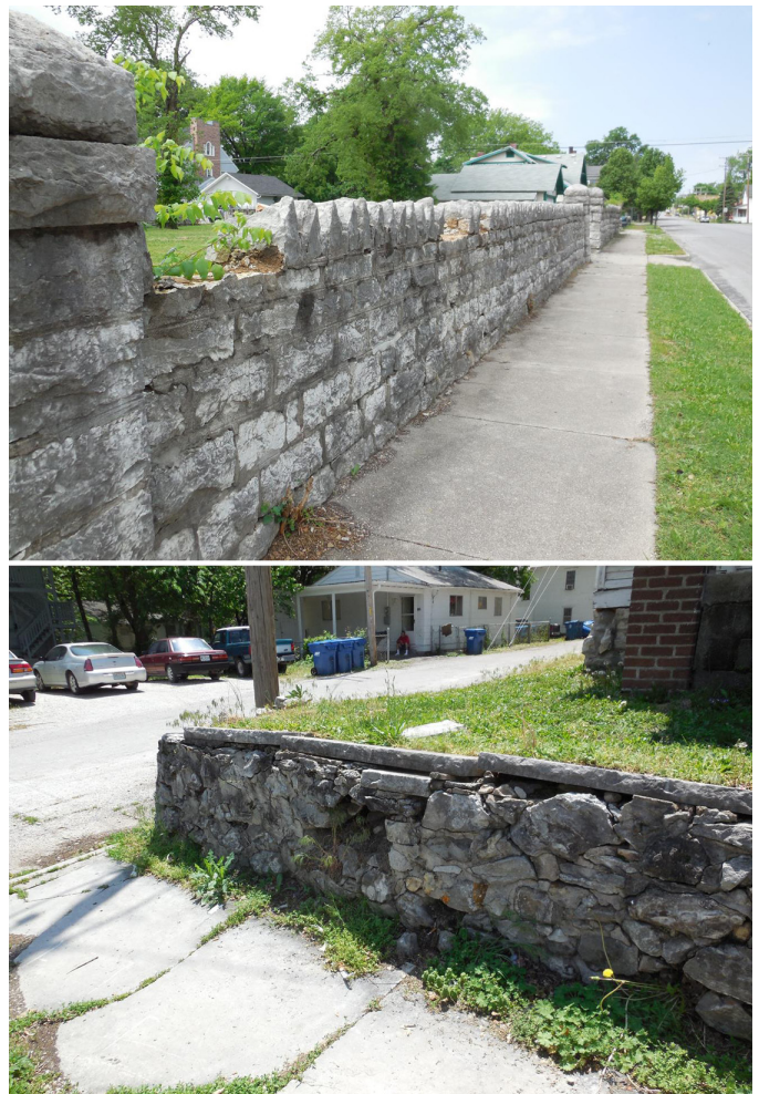
Fig. 3. Rock and concrete walls inhabited by the Northern Italian Wall Lizards ( Podarcis siculus campestris ) in Joplin, Missouri.