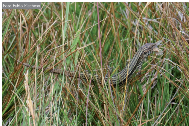
Figure 2: Adult male of Z. vivipara feeding on teneral of S. flaveolum .

Most specimens were found at a distance of less than 10 m from water surface. In August 2014, we observed several adult specimens of Z. vivipara of which at least two (a male and a female) were feeding on teneral of S. flaveolum (Figure 2). At the same time, a massive emergence of teneral resting on the surrounding vegetation was taking place. This predatory behaviour was observed over approximately 2 h. The fact that Z. vivipara predate on this Odonata is interesting since predation on dragonfly imago by this species of lizard was not previously reported. Intriguingly, predation only took place on dragonflies, which are larger than damselflies (Odonata, Zygoptera), even though the latter were fairly abundant, in particular teneral of Lestes dryas . It is suggested that dragonfly predation would be due to the insects search for good energy sources and the fact that the prey were teneral imago, unable to fly and hence easy for the lizards to catch. It could be suggested that this prey type is only hunted on days on which dragonfly imago do not have hardened wings and bodies since when these gain greater consistency it is possible that the lizards would